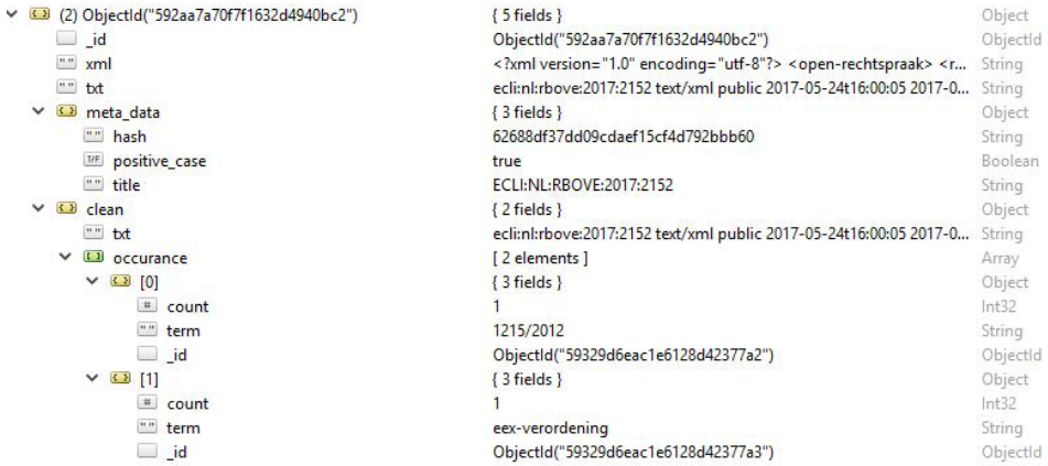
Figure 2: Example of positive case in MongoDB with all instances.