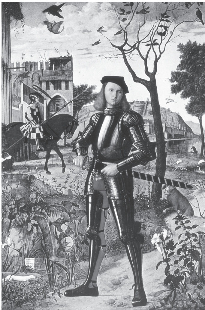
Figure 1: The 'Knight with the Ermine', probable portrait of Ferdinand II of Aragon, King of Naples (1467–96), by Vittore Carpaccio (Lugan, Thyssen Collection).