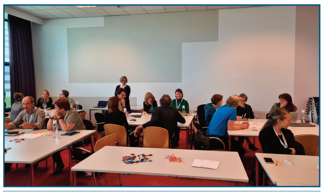
Fig. 1. Group discussions during the workshop.

Whether a search is being updated using the same search string or changes are introduced depends on the quality of the original search and if the topic is still ex-