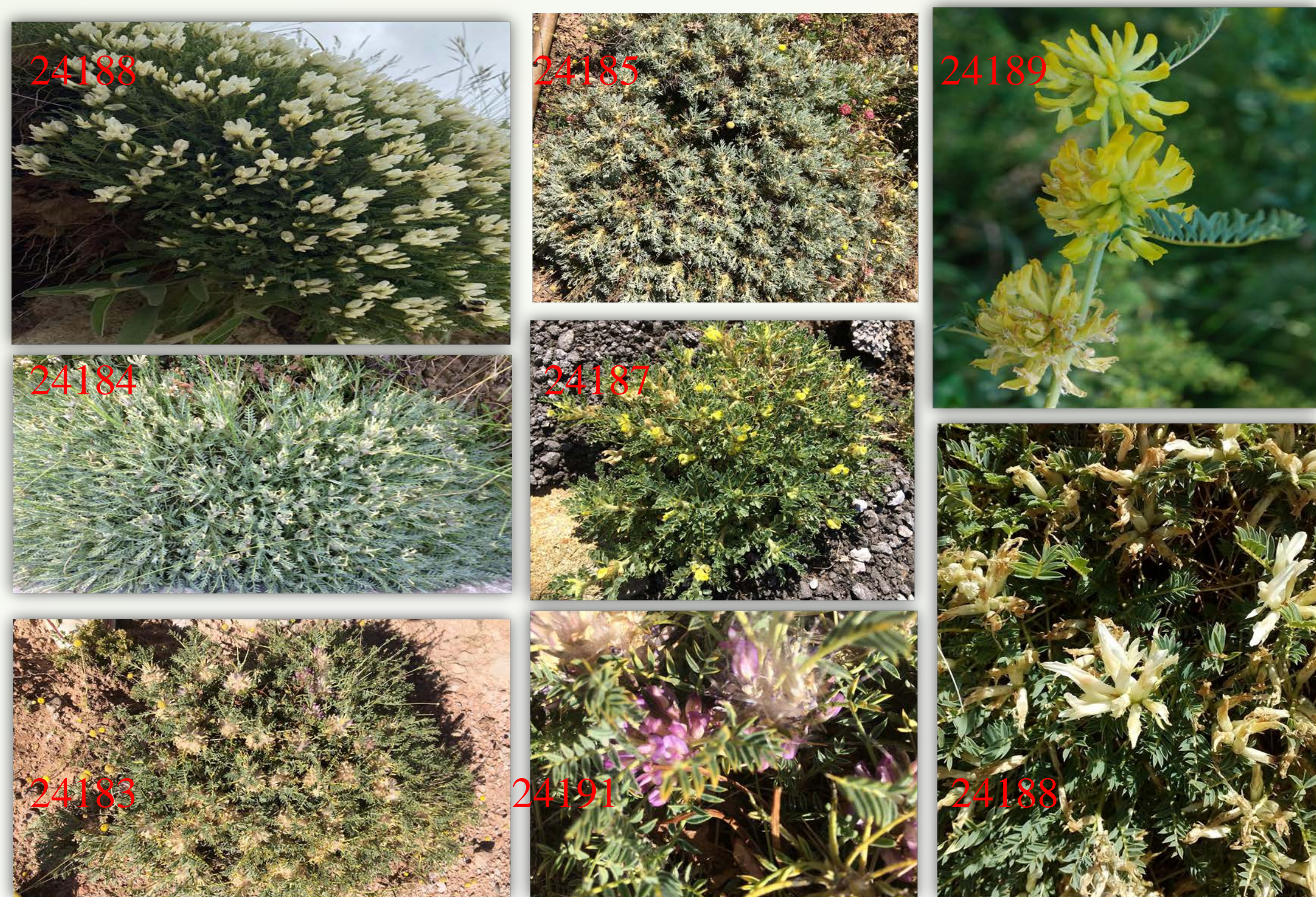
Figure 1. Collected Astragalus spp. from Kumalar Mountain

Abstract: Astragalus L. (Fabaceae), one of the largest genera in Angiosperm, is represented with approximately 2500-3000 taxa. With the aim to study Astragalus taxa in Anatolia, Turkey, that is reported 425-450 taxa (endemism ratio 47-50%), we report anti-inflammatory effect of ethanolic extracts of roots from six Astragalus spp. and phytochemical investigation of Astragalus strictispinus Boiss. Phytochemical analysis of Astragalus strictispinus roots resulted in isolation and structural identification of 25 cycloartane type triterpenoids (1-25) including nine undescribed cycloartanes, eleven flavonoids and lignans (26-33), one pterocarbon and one pterocarbon glycoside (34-35), a steroidal glycoside (36).