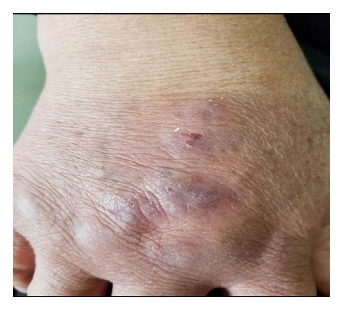
FIGURE 1 Erythematous purple plaques on the right hand dorsum

In this article, we reported a case of lichenoid drug eruption related to omalizumab administration which were triggered by sun exposure.