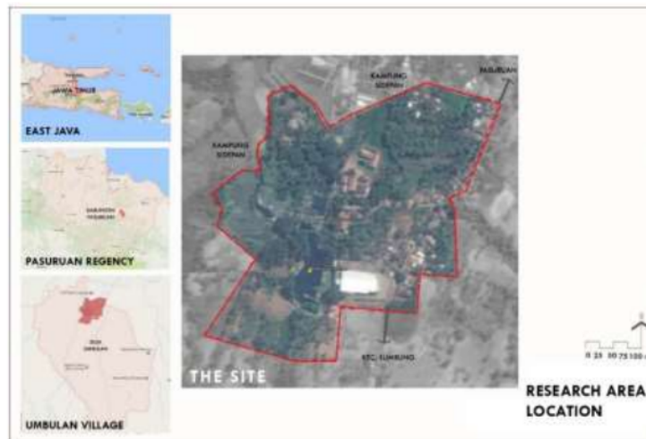
Figure 1. Location of the research area

The research was conducted in the Umbulan Water Spring, Umbulan village, Winangun district, Pasuruan regency, East Java (Fig. 1). It was carried out from August 2016 to March 2017. The research activities consisted of preparation, collecting primary and secondary data through site observation, interview and literature study; analysis of physical elements and perception; and synthesis to formulate the users-site interaction particularly in the context of the space use, the landscape meaning, and the impact on the site.