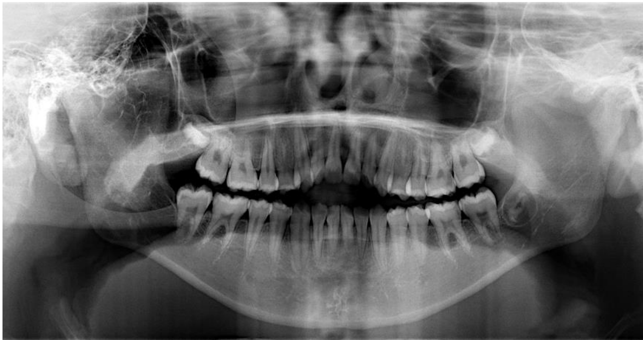
Figure 1. Panoramic radiograph

A healthy, 12-year-old female patient, presented with an anterior open bite requesting orthodontic treatment. A panoramic radiograph was requested for treatment planning (Figure 1). An incidental finding of well-defined multilocular radiolucencies were detected superimposed over the right ramus and middle cranial fossa region. The patient was asymptomatic with no clinical signs of facial asymmetry. A cone-beam computerised tomography (CBCT) scan was requested to exclude any occult pathology (Figure 2).