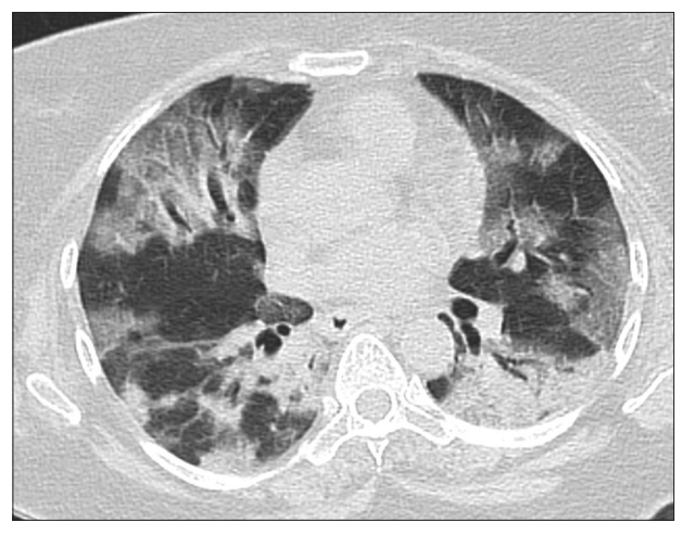
Figure 2: HRCT chest axial image at mid thoracic level in a 36-year-old female (with CTSS-15) shows multiple patchy ground glass opacities and consolidation