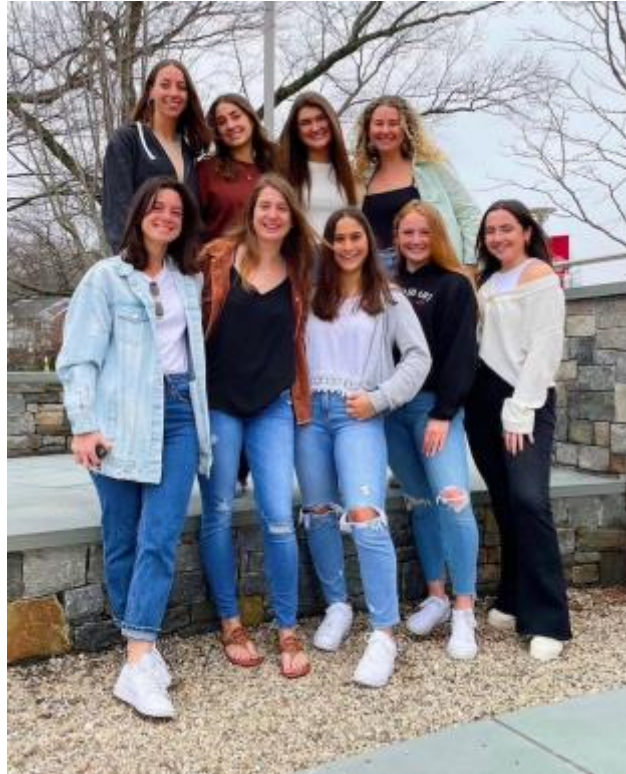
9 - Previous Executive Board

On November 16, 2021, the Student Occupational Therapy Association (SOTA, previous executive board pictured left) and the Coalition of Occupational Therapy Advocates for Diversity (COTAD) held elections for their new executive boards. Congratulations to all nominees on their positions, and thank you to the previous executive board for their outstanding service!