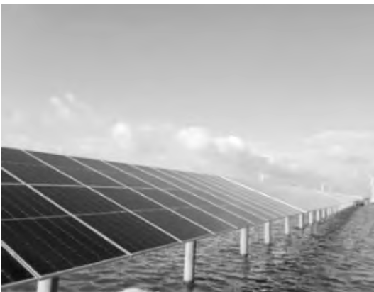
Fig. 3 Domestic fishery light complementary cases