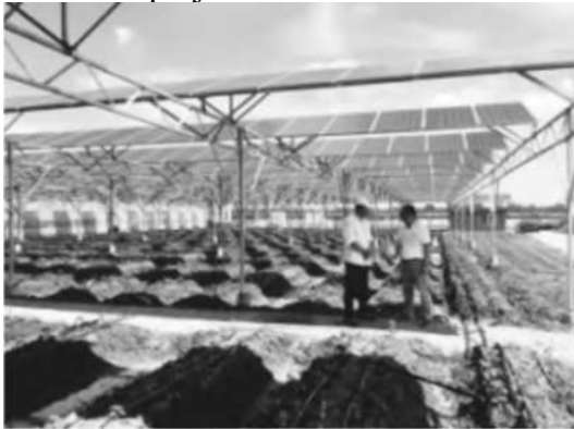
Fig. 2 Domestic agricultural light complementary cases

fishery light complementarity are shown in Figure 3. In combination with the current background of rural revitalization, agricultural light complementation has become a major boost to rural revitalization. For example, the agricultural photovoltaic power generation project in Liuwang Town, West Coast new area of Qingdao, which focuses on Agricultural light complementation, adopts the mode of fishery light complementation and forest light complementation, and maximizes the use of agricultural facilities for power generation [14]. Based on the local reality, combined with modern photovoltaic technology and agricultural technology, the project has successfully set a model for other rural revitalization projects.