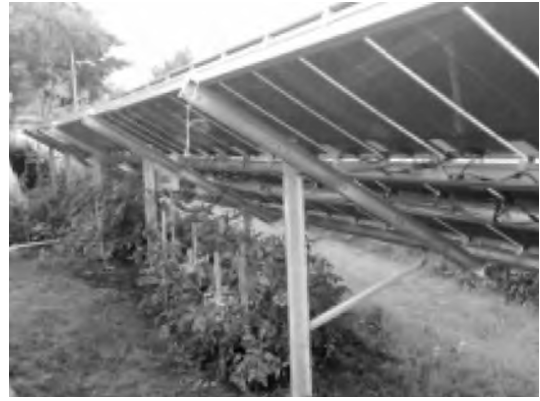
Fig. 4 Tomato production under solar panels in dornbien, Austria