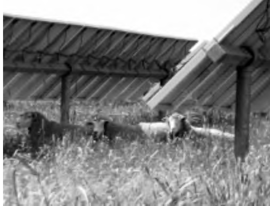
Fig. 5 Photovoltaic panels and sheep on Lanai Island, Hawaii

photovoltaic agriculture has expanded tourism and urban ecology at the same time, which has brought far more value to the society than the benefits brought by single agricultural production.