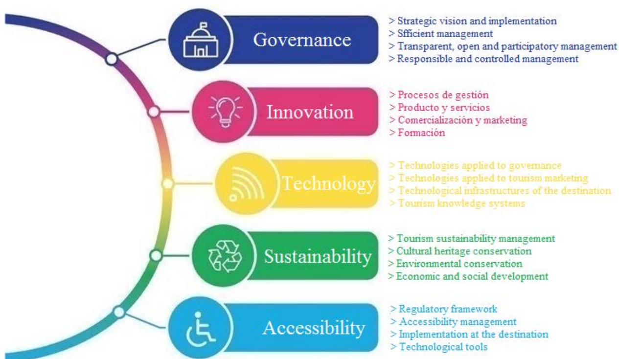
Figure 3. Axes of the ITD methodology.

The definition encompasses the 5 pillars on which an ITD is based: Innovation, Technology, Sustainability, accessibility and Governance, the foundations for the development strategy that guarantees competitiveness through a process of continuous improvement. A management model that also considers the cross-cutting nature of tourism activity and the differentiating characteristics of each destination.