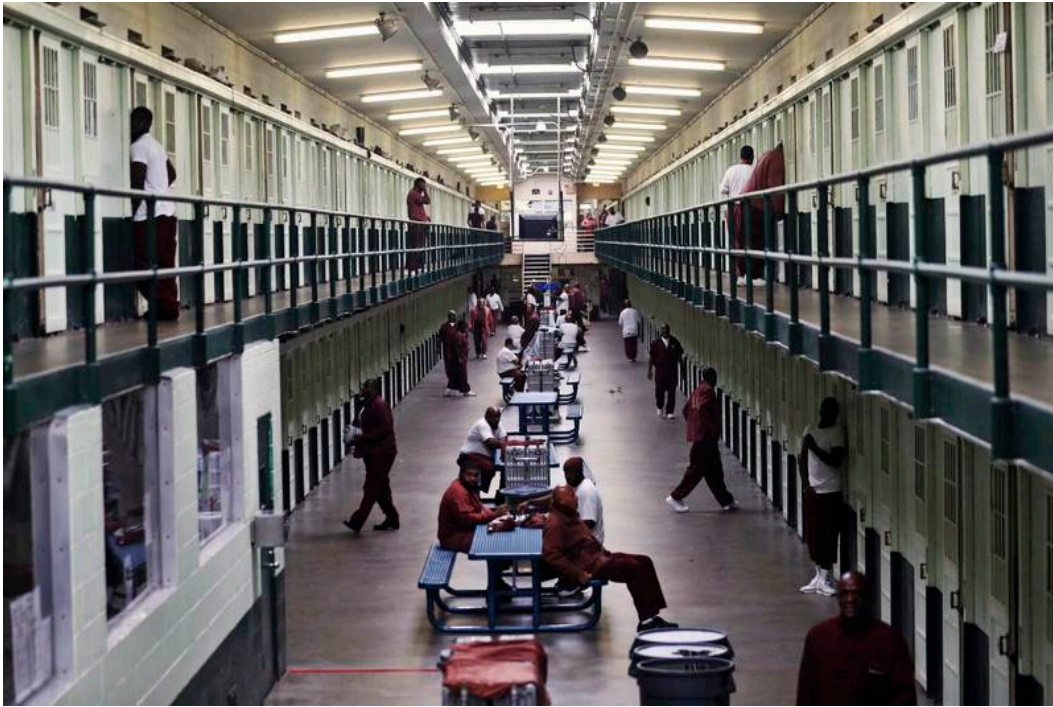
Let them become productive citizens even behind bars.

New York Daily News • Dec 09, 2019, at 5:00 am