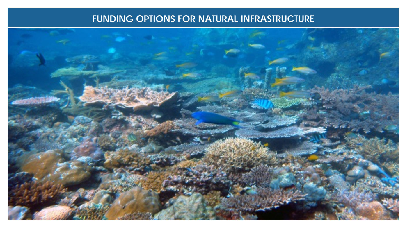
Coral reefs are natural breakwaters, protecting coastlines from flooding and erosion.

This section provides an overview of funding options for natural infrastructure in the United States and Europe, as well as options employed by international development organizations globally. Funding sources in Asia are not included. The descriptions are meant to provide general information only, and do not constitute specific advice for any one situation. The catalog is incomplete, and virtually all the funding sources discussed are undergoing constant evolution in funding targets and amounts.