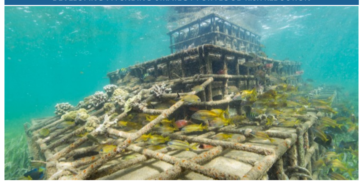
This artificial reef in Grenville, Grenada prevents coastal erosion and provides multiple ecosystem benefits.

The catalog of available funding sources for flood risk reduction seen above shows that there is a very large array of choices from which those seeking to reduce risks can assemble resources and from which those seeking to deploy capital for risk reduction can devise viable strategies. But, as noted above, there are many factors that shape the circumstances in which risk reduction and funding decisions will be made. We briefly discuss a few key factors and elaborate on these using case-studies two distinct at-risk geographies: The Northeastern U.S. and The Philippines. Depending on the local configuration of these factors, some types of funding are more or less likely to be usable. Also as noted, these factors are complex and multidimensional, and thus require specific local analysis. Nonetheless, it is possible to examine each of the factors and some of their principal elements as they relate to the general funding strategies discussed.