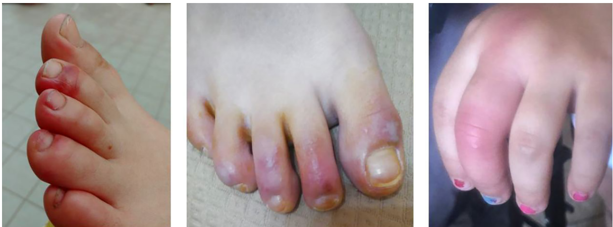
Figure 2. Chilblain-like pattern