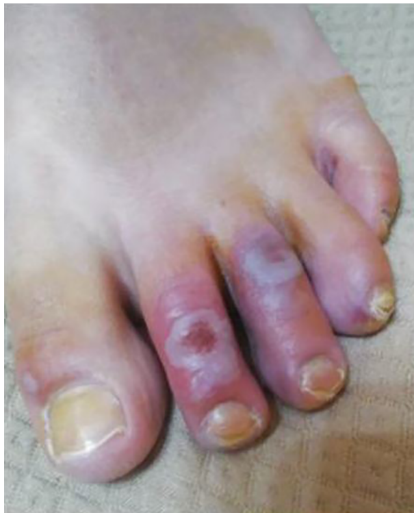
Figure 4. Skin ulcers