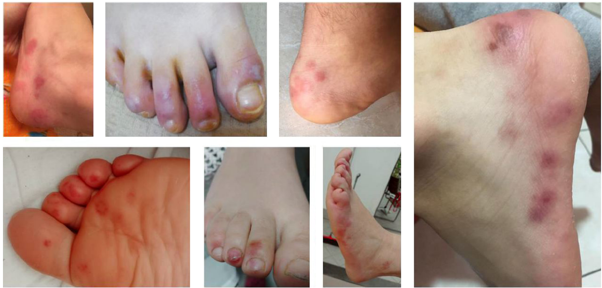
Figure 3. Red to purple macules, plaques, and nodules, also with erythema multiform-like