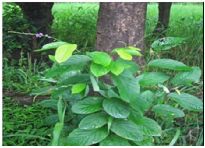
A. D. gangeticum leaves.

It is one of the essential herbs of ethnomedicine that have been used extensively either as a single drug or