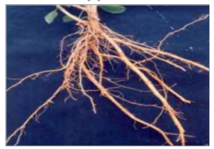
D. D. gangeticum roots.