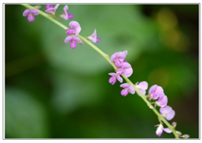
C. D. gangeticum flowers.