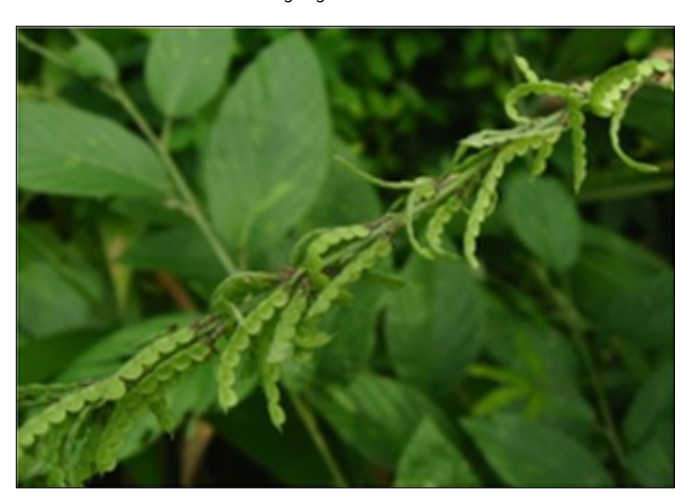
B. D. gangeticum fruits.