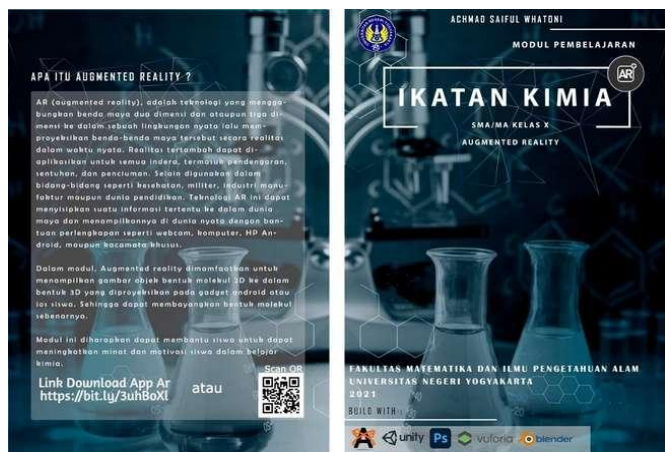
Figure 2. Cover of chemical bonding module

require a high-spec smartphone. The display of learning modules and augmented reality applications are shown in Figures 2 and 3.