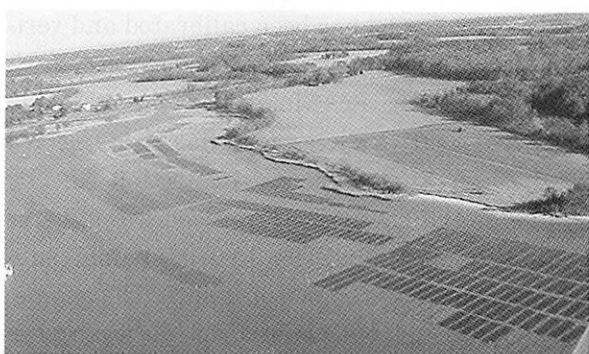
Fig. 2. Aerial view of a clam farm in Chesapeake Bay, U.S.A. Each rectangular net is approx. 4 m \times 18m and covers 50,000 clams.

Detailed descriptions of the production practices for farming hard clams are given in Manzi and Castagna (1989) and Castagna (2001). Briefly, larvae are spawned and reared in hatcheries in seawater ranging from 20 to 35 ppt. Post-set juveniles are generally raised in land-based, flow-through nursery systems until they reach a size of 3-4mm in shell height. At that time they are placed into one of several types of field nursery systems-either fine mesh bags, sand-filled trays or floating upweller systems-and grown to a size range of 10-15mm. Clams are then planted in the low intertidal and subtidal zone in sand and sand-mud mix bottoms for grow-out to market size. Generally clams are planted in rows approximately 4 m \times 18m at densities ranging from 550 to 1650 clams m^{-2} and covered by polyethylene netting that serves as predator protection. A typical