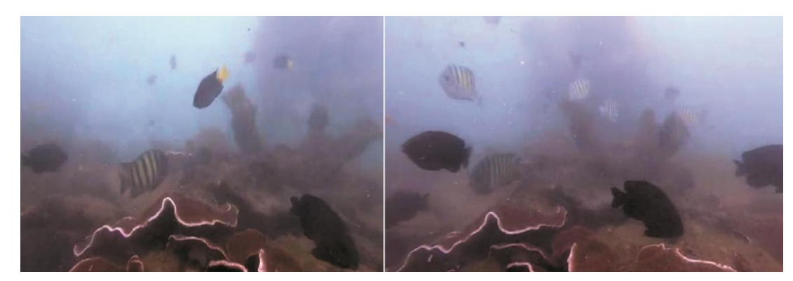
Fig. 3 — Fish species assemblage recorded in the patchy coral reef of Terekhol (Fish species in picture: Abudefduf saxatilis , A. bengalensis , Chrysiptera sp., Chromis sp., Dascyllus sp., Acanthurus sp.)