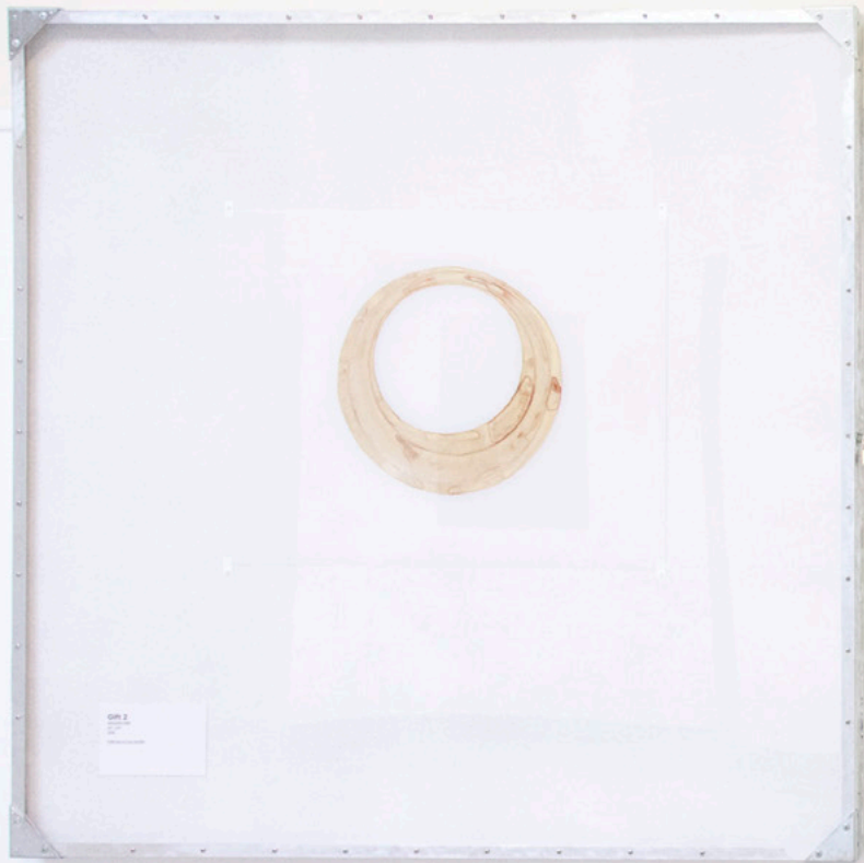
DRIFTWOOD BY [unreadable]