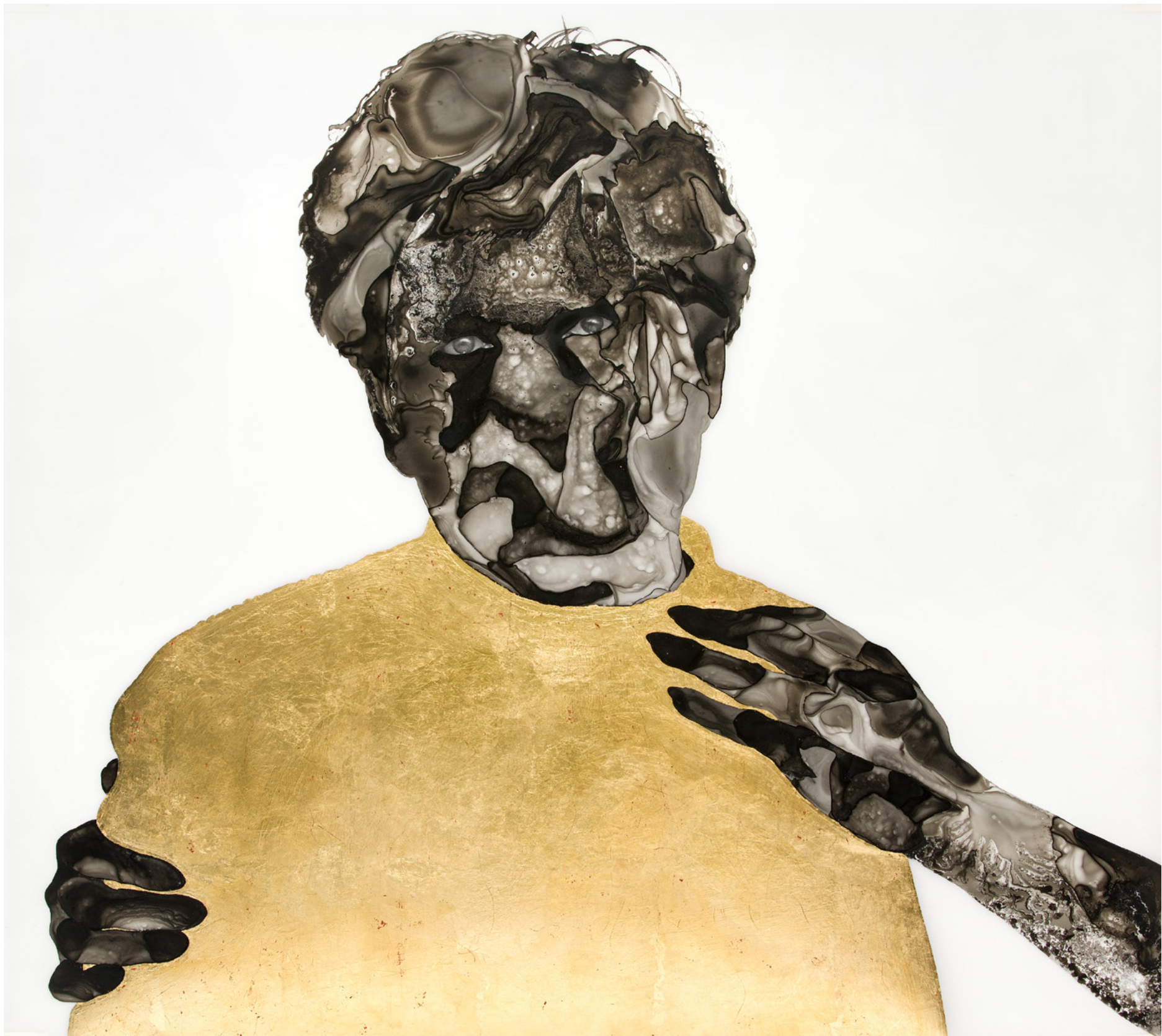
The Elder 2018, 31" x 34" India ink, graphite, and gold leaf on Dura-lar film