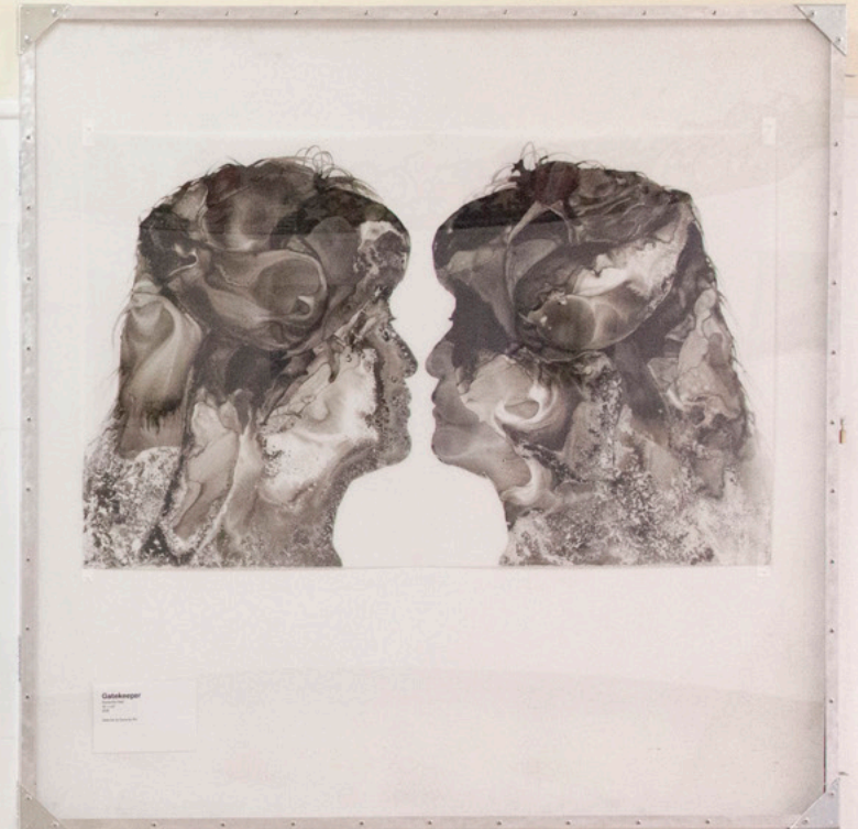
Gabe Kasper Bust 2007