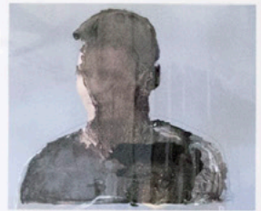
Lionel Messi BY [unreadable]