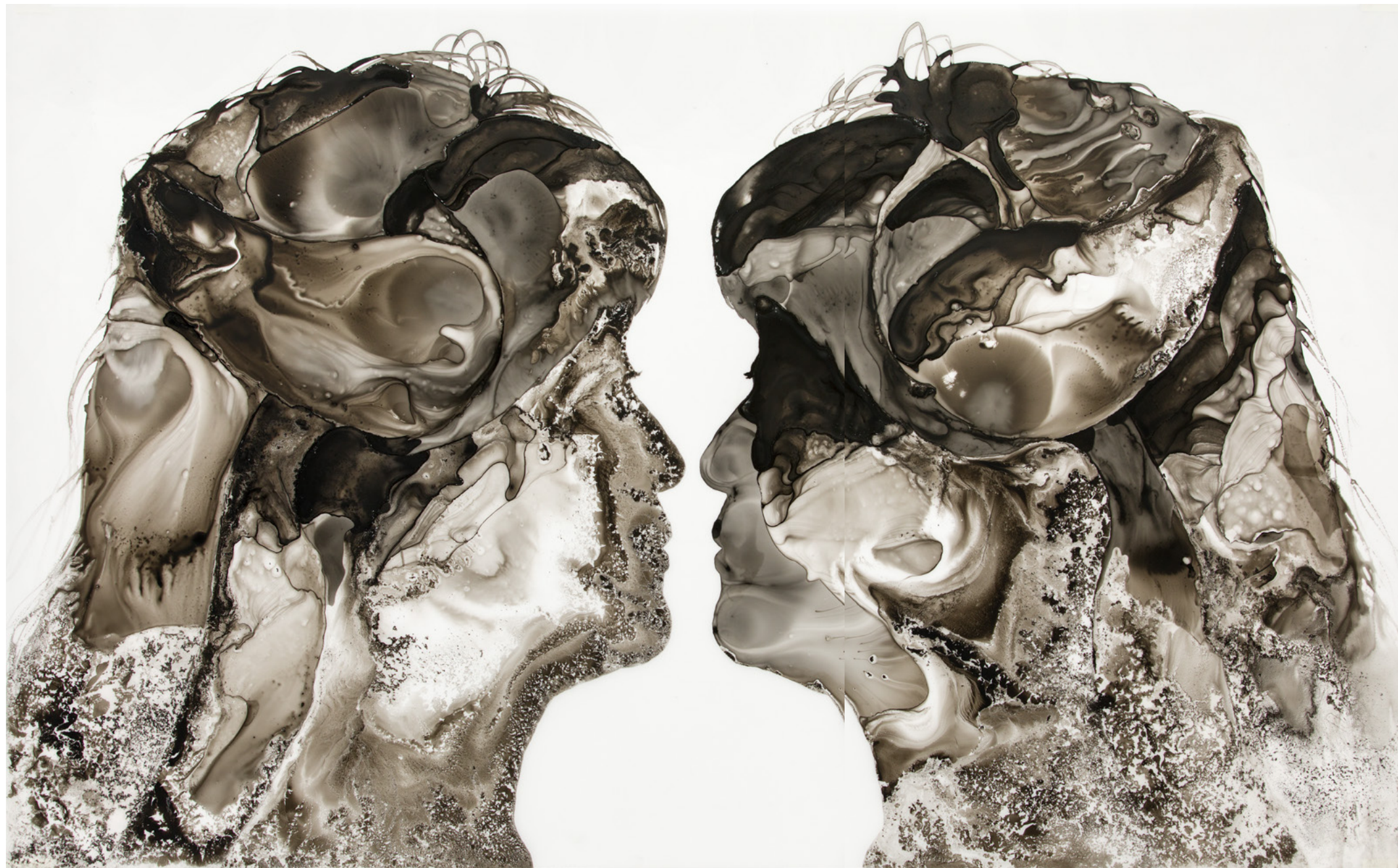
Gatekeeper 2018, 25" x 40" India Ink on Dura-lar film