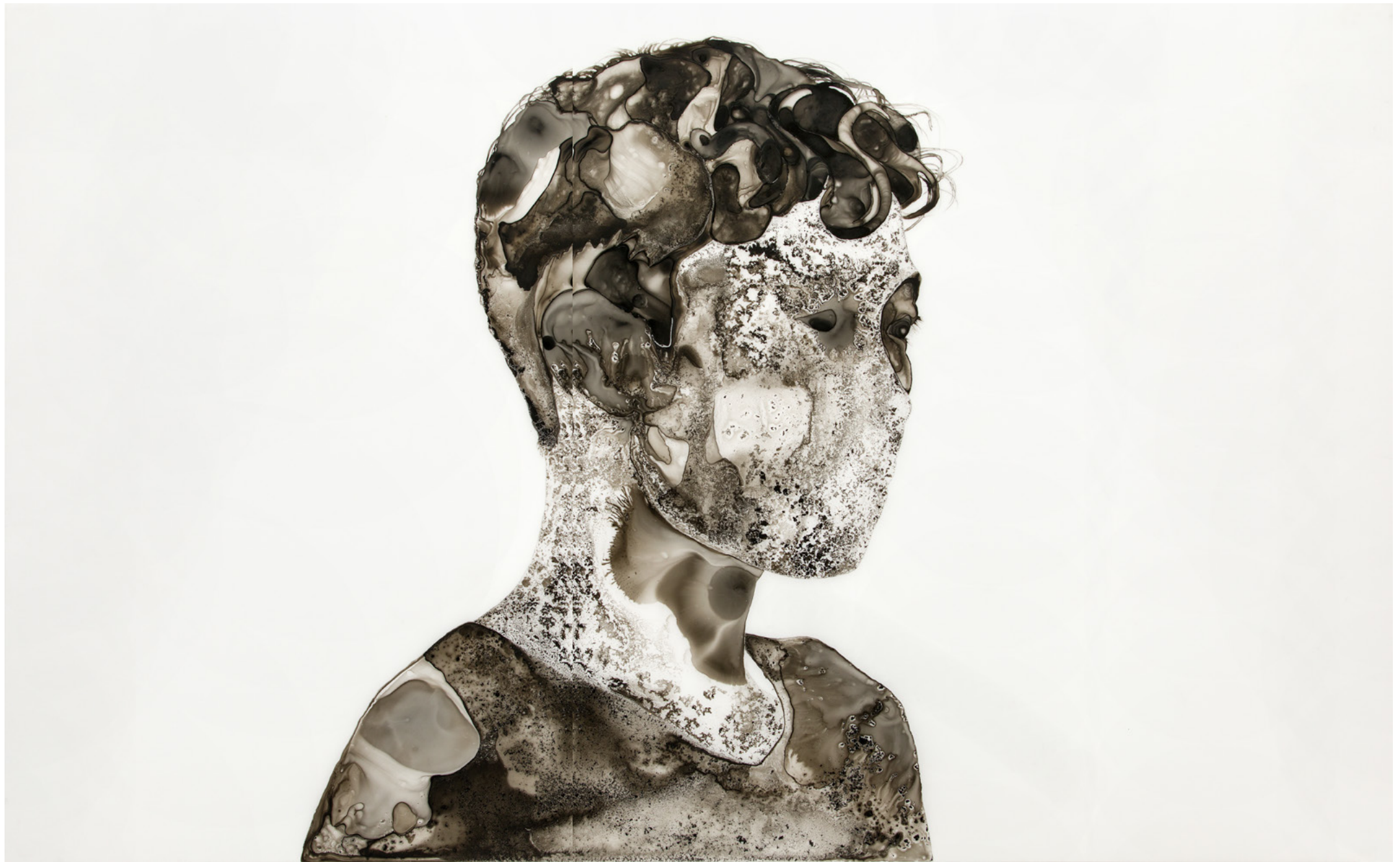
First Born 2018, 25" x 40" India ink on Dura-lar film