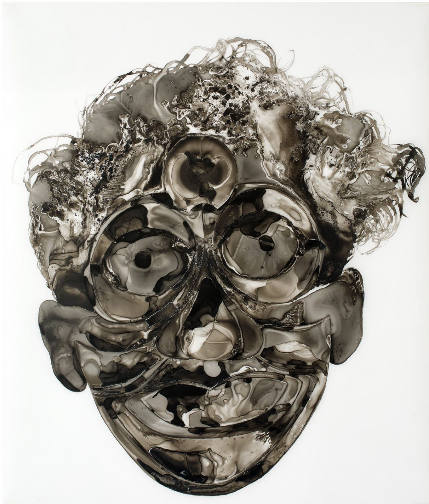
Oracle 2018, 40" x 34" India Ink on Dura-lar film