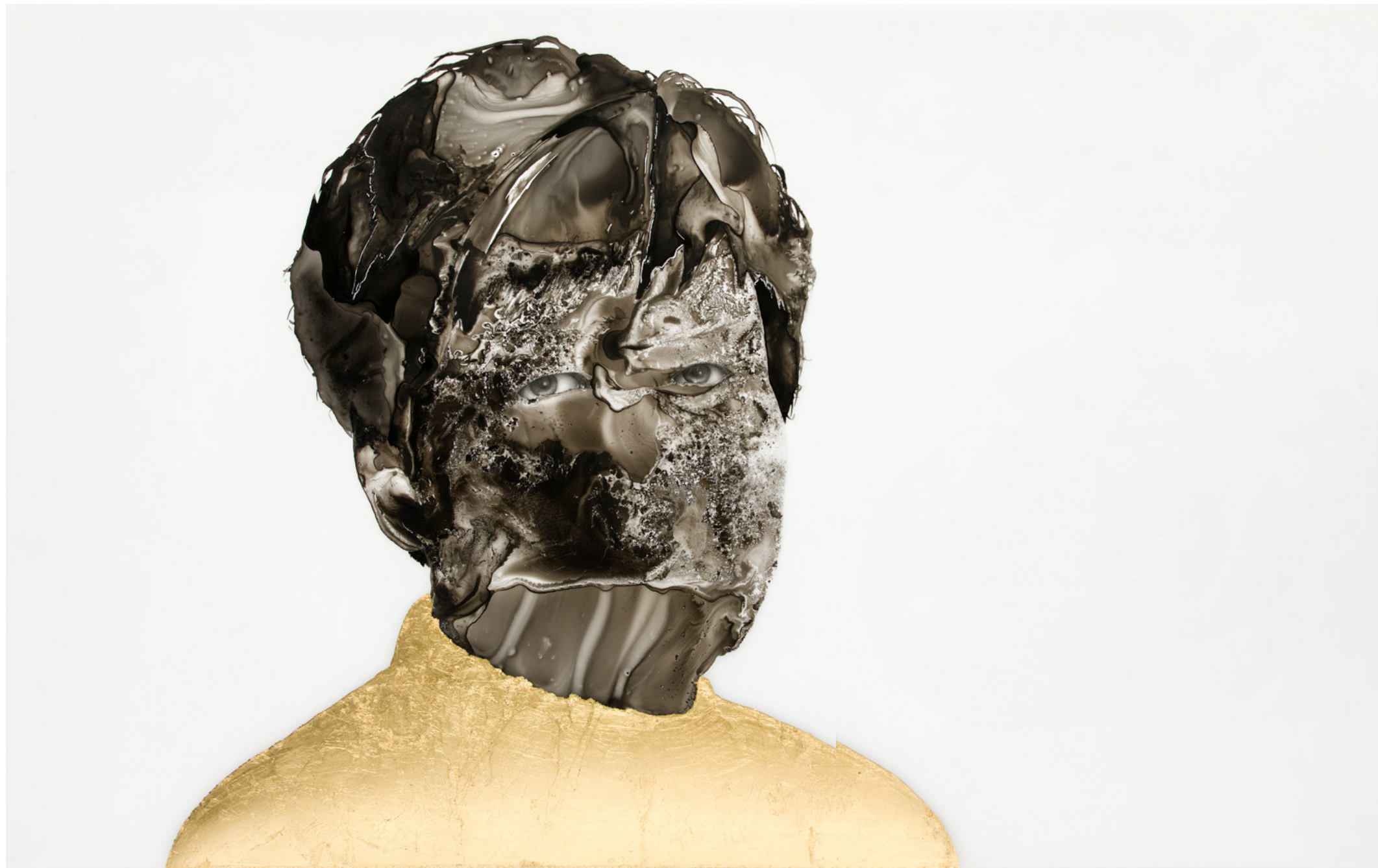
Okay Soon... Fleece 2018, 25" x 40" India Ink, graphite, and gold leaf on Dura-lar film