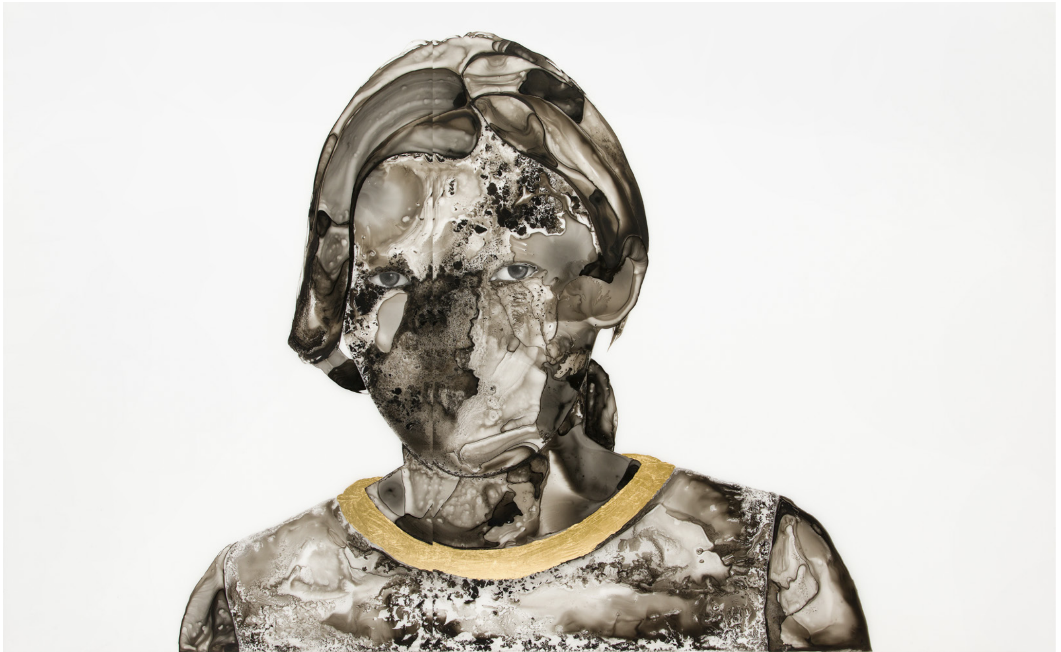
Grace 2018, 25" x 40" India ink, gold ink, and gold leaf on Dura-lar film