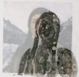
Sacagawea BY [unreadable]