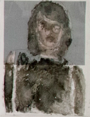
Taylor Swift BY [unreadable]