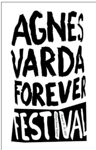
Screenprinted Poster (11" x 17") $15.00

Order shirts and bags online! Scan the above code or go to: www.etsy.com/shop/helloprettycity