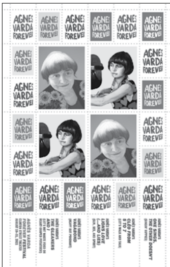
Poster Stamp Sheet With Artwork by Shelbie Loomis (5.5" x 8.5") $10.00

Available through the Clinton Street Theater