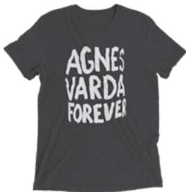
Adult T-Shirt $21.99