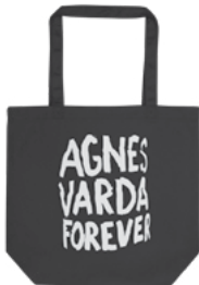
Tote Bag $19.99