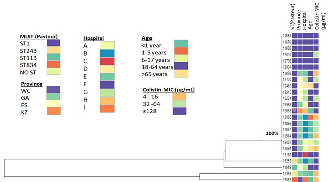
Fig 3. Phylogenetic comparison of colistin-resistant Acinetobacter baumannii bloodstream isolates from South Africa from 1 April 2017 to 30 September 2019, n = 24.

https://doi.org/10.1371/journal.pone.0271355.g003