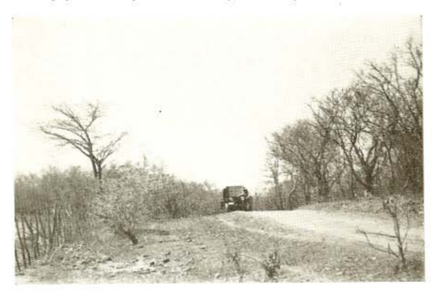
Fig. 2 — A view of the semi-arid plains of Northeastern Brazil (the "sertões"), where kala-azar is sporadic.

In a careful study of the main endemic area in Ceará 29, 20, we have seen that about fifty per cent of the rural population inhabit the plains and forty per cent the plateaus. The remaining ten per cent live on the foothills ("pés-de-serra") or in vallevs between hills ("boqueiroes"), on lands which are much valued because they are considered good for small agriculture and cattle-raising (Figs. 3 and 4). These latter ten per cent have supplied more than 60 per cent of the kala-azar cases diagnosed in the area during a 16-month period, and the occurrence of several cases per family at the same time or in close sequency, was a common fact among them. Informations gathered among the local population led us to the conclusion that in those foothills and valleys kala-azar has been long endemic with periodical epidemic outbreaks. That in the