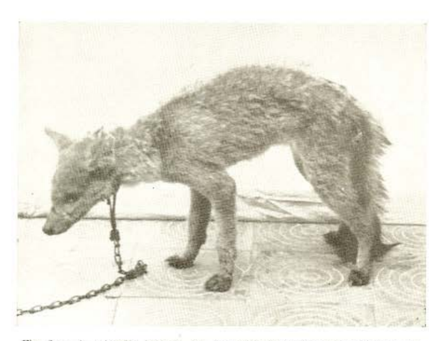
Fig. 6 — A naturally infected fox Lycalopex vetulus in the late stage of visceral leishmanlasis.