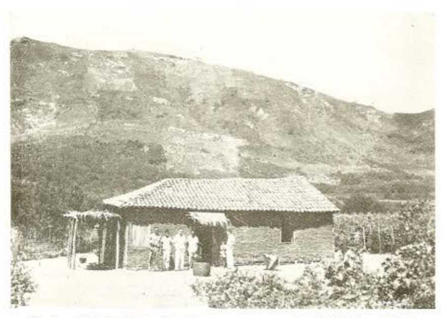
Fig. 4 — The residence of a kala-azar case, on a foothill, State of Ceará.

gins of lower Jaguaribe River (in Ceará), or along the sea coast. On the other hand, it is rare or absent on the plateaus above 800 meters altitude,