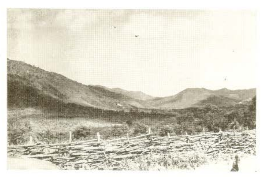
Fig. 3 — Valleys between hills in Northeastern Brazil ("boqueirões"), where kala-azar is endemic with epidemic outbreaks.