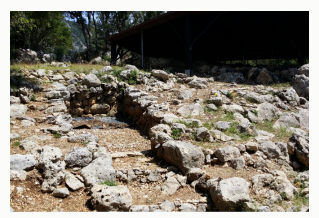
Figure 2. Ossuary at Borzi Hill as it currently appears

"ossuaries" (Galaty, 2016; Souyoudzoglou-Haywood, 1999). These ritually significant practices are better described as secondary treatment or secondary burials within existing tombs (Jones, 2014). If an ossuary is more precisely defined as a purpose-build structure for secondary burial as seen at Odiyitria, then there are only two known ossuaries from the LH: one is at Ksagounaki, Mani, Peloponnese (Galaty, 2016) and the other is the one at Borzi Hill (Figure 2).