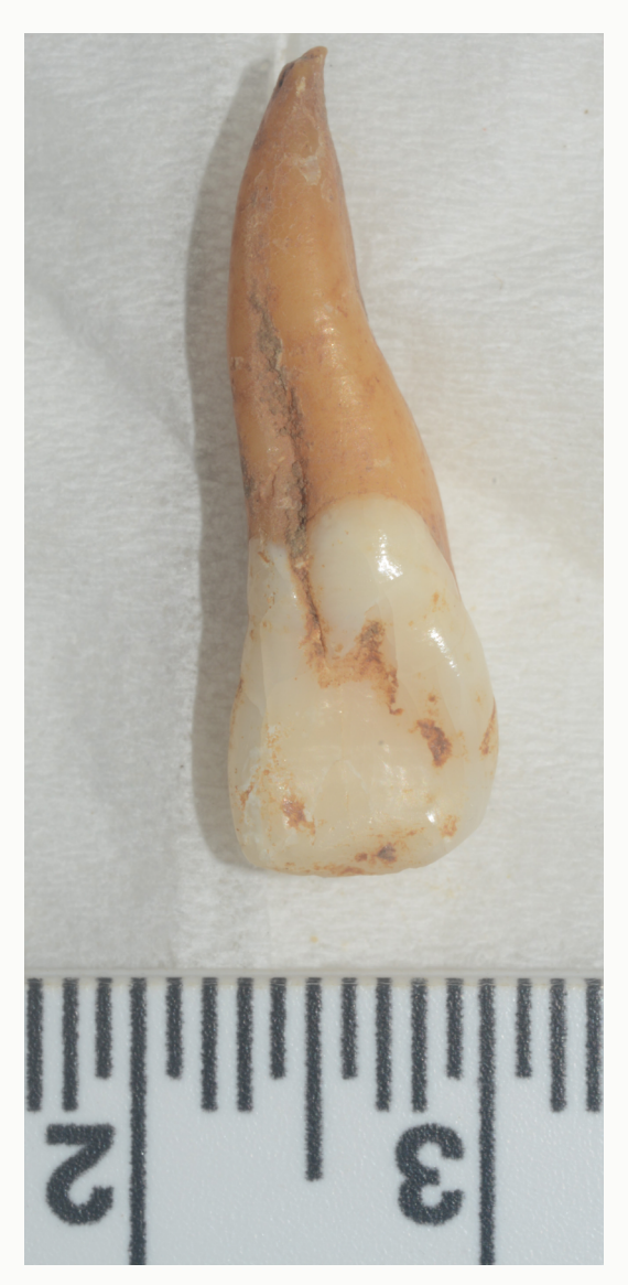
Figure 3. Hyper-shoveled maxillary lateral incisor. The entire crown and root are curved into a canal with a pit in the crown and a fissure extending the length of the root

Reference: Photo taken by the author in 2016