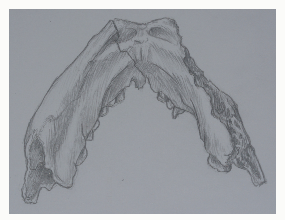
Figure 4. Symmetrical manifestation of pronounced digastric fossae (large symmetrical ovals at top) on No 38 from OHKH 1. Mandible is view from below. Anterior (chin) is towards the top of the picture. Note how enlarged fossae make chin more pronounced (see also Figure 5) Reference: Sketch made by the author's research assistant, Sarah Shaver, in 2019