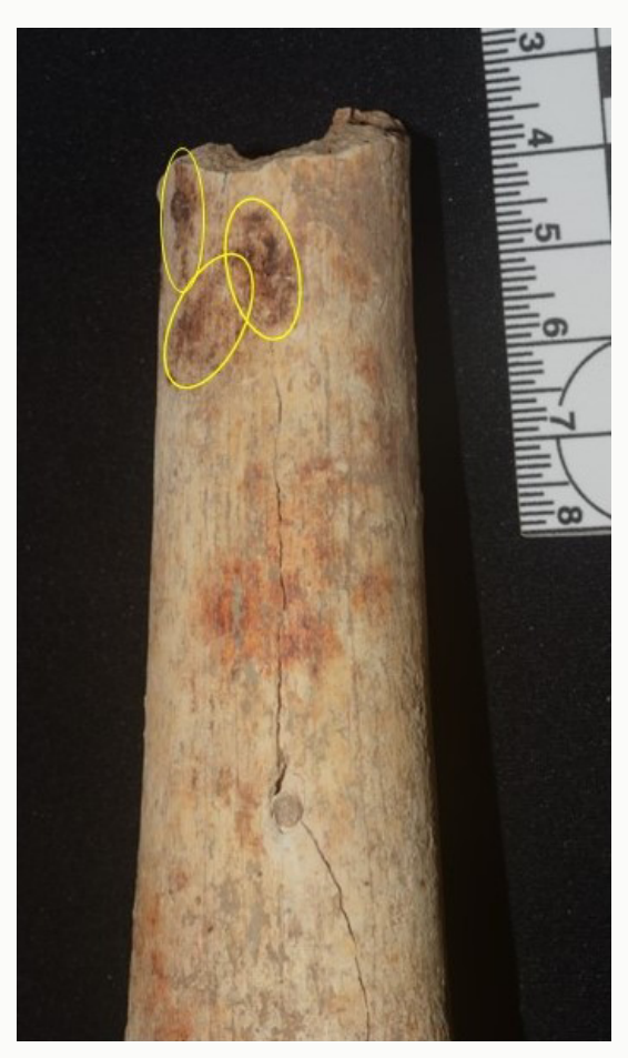
Figure 6. Anterior view of mid-shaft of femur from ossuary. Note the oval brown stain likely cause by amber beads, and the bright red rust stain likely caused by oxidized iron