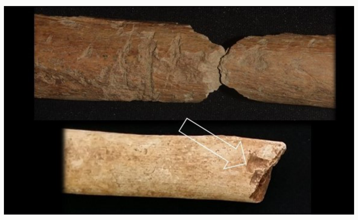
Figure 7. Examples of intentional chop marks found on bones in both tombs. Top: a tibia with over a half dozen marks in a small area of the mid-shaft. Bottom: a humerus with three distinct marks close together. Uniform staining in the chop mark indicates breaks are ancient

The other possible explanation for the missing skeletal elements is that the bones were intentionally broken down into smaller pieces either as part of the initial mortuary practices after skeletonization and secondary positioning within the tholos, or as a political act of desecration by looters with the collapse of power structures in society. More research is required, but there is some evidence to support this hypothesis of intentional breakage. Many of the more fragile skeletal elements that are missing such as ribs, would have been easier to break and once broken would have been susceptible to further environmental degradation. Whereas intentional breakage of more robust long bones would survive, and the evidence of intentional breakage should be visible. Various examples of healed premortem trauma and sharp force perimortem trauma have been identified in multiple individuals, and clear evidence of cut marks associated with butchering are visible in many of the animal remains (see section below on faunal remains). However, the pattern seen in many long bones is consistent with intentional chopping of bones at mid-shafts (Figure 7).