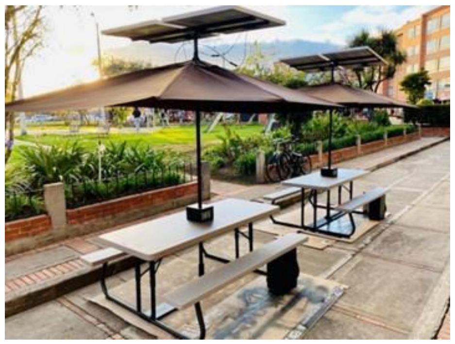
Figure 2. Example of a solar table for charging portable equipment.

a continuous charge, using the sun as a renewable source with countless benefits, one of them, as a representative green symbol that reduces the carbon footprint of the University in the city since for every kilowatt hour (kWh) that is generated by photovoltaic solar energy, the emissions of CO2 are reduced by 0.6 kg, which means that for every kilowatt hour (kWh) generated, 0.6 kg of CO2 are prevented from reaching the atmosphere, causing damage to the ozone layer and generating global warming [4].