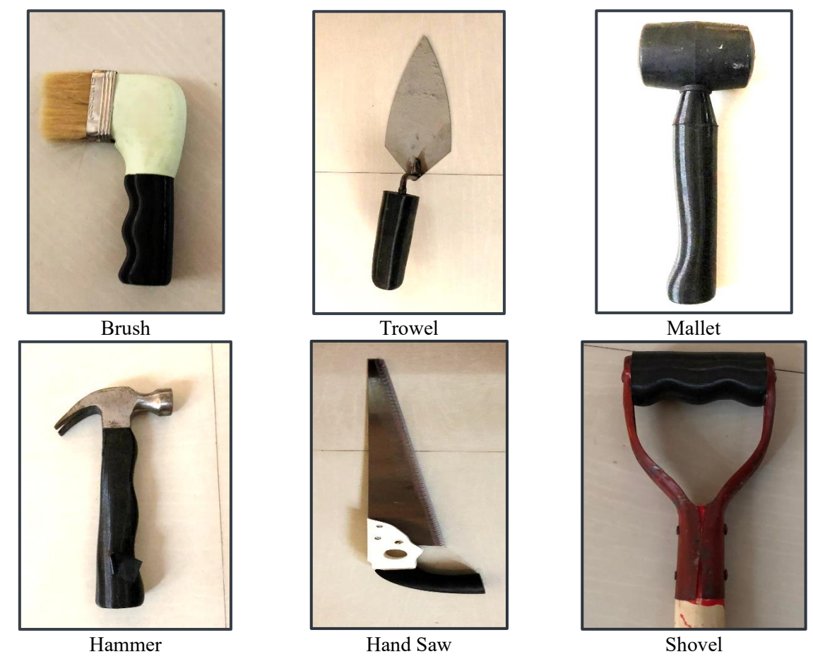
Figure 2. Actual photos of 3D-printed tool handle in their corresponding tools