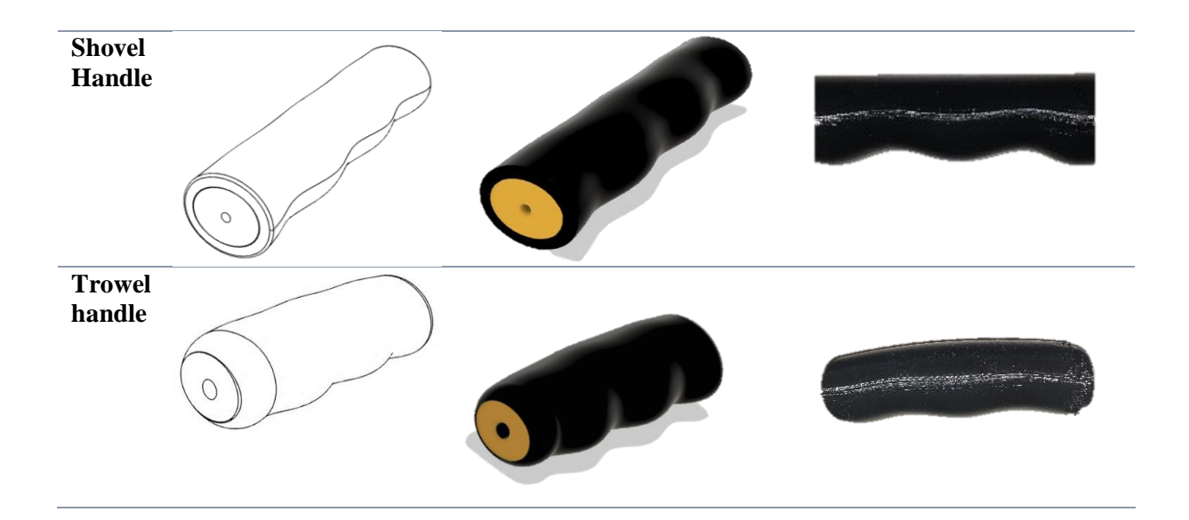
2.2.3 Testing and subjective comfort rating