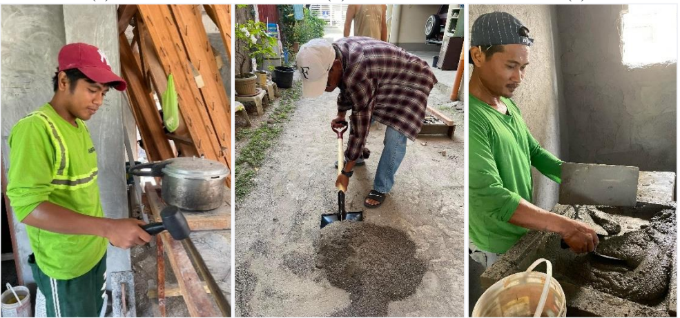
(d) (e) (f) Figure 3. Actual testing and evaluation of (a) Hammer, (b) Paint Brush, (c) Hand Saw, (d) Mallet, (e) Shovel, and (f) Trowel.