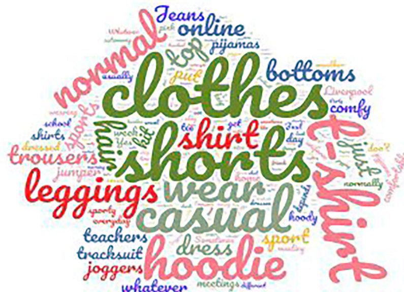
Fig. 10 Word cloud from the questionnaire »Dressed for Home-schooling«, April-June 2020, 6-12 years old.

The coding phase implied for the researchers to be able to overcome the problems related to the vocabulary used by children, their description of clothes using vernacular or distorted words, and their tendency to use comparative or default answers to describe the changes in their habits: for example, »...whatever clothes are in hand« / »I don't wear the same as at school« (without any indication of what is worn at school)... Therefore, thanks to the contextualisation of the answer and comparative approach with the visual information, further interpretation has been possible.