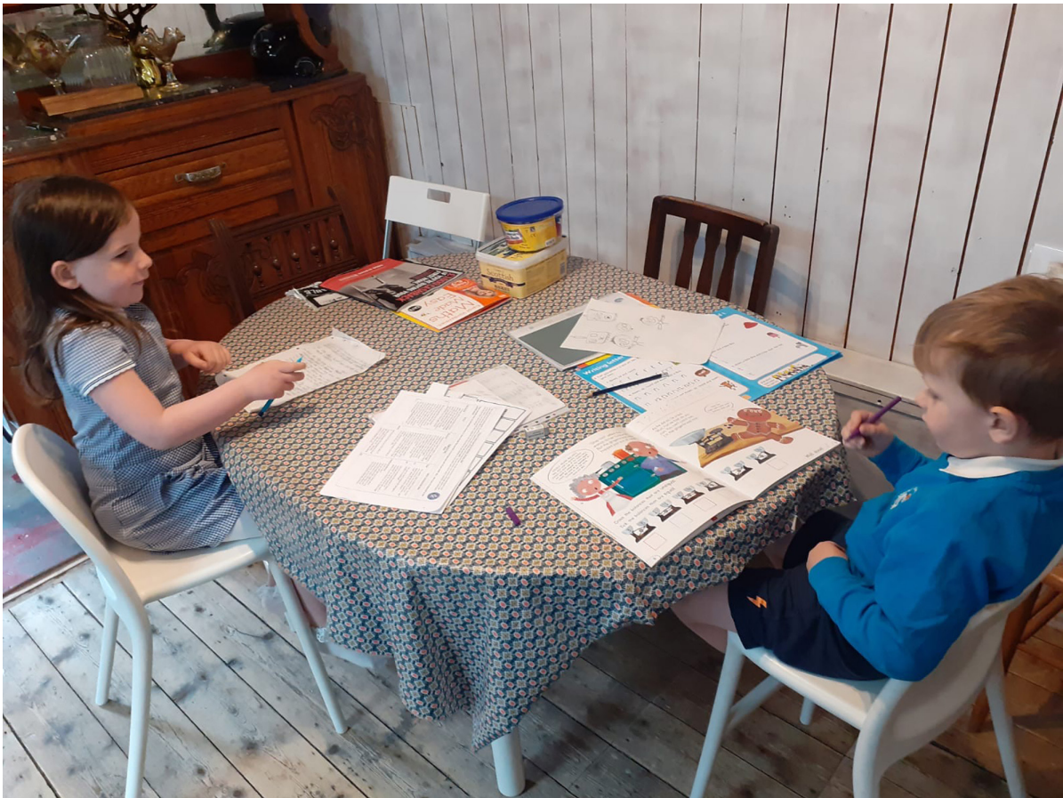
Fig. 12 Children dressed for home-schooling in their School uniforms, May 2020, Galashiels, Scotland.

Three themes were identified in the analysis of this survey: