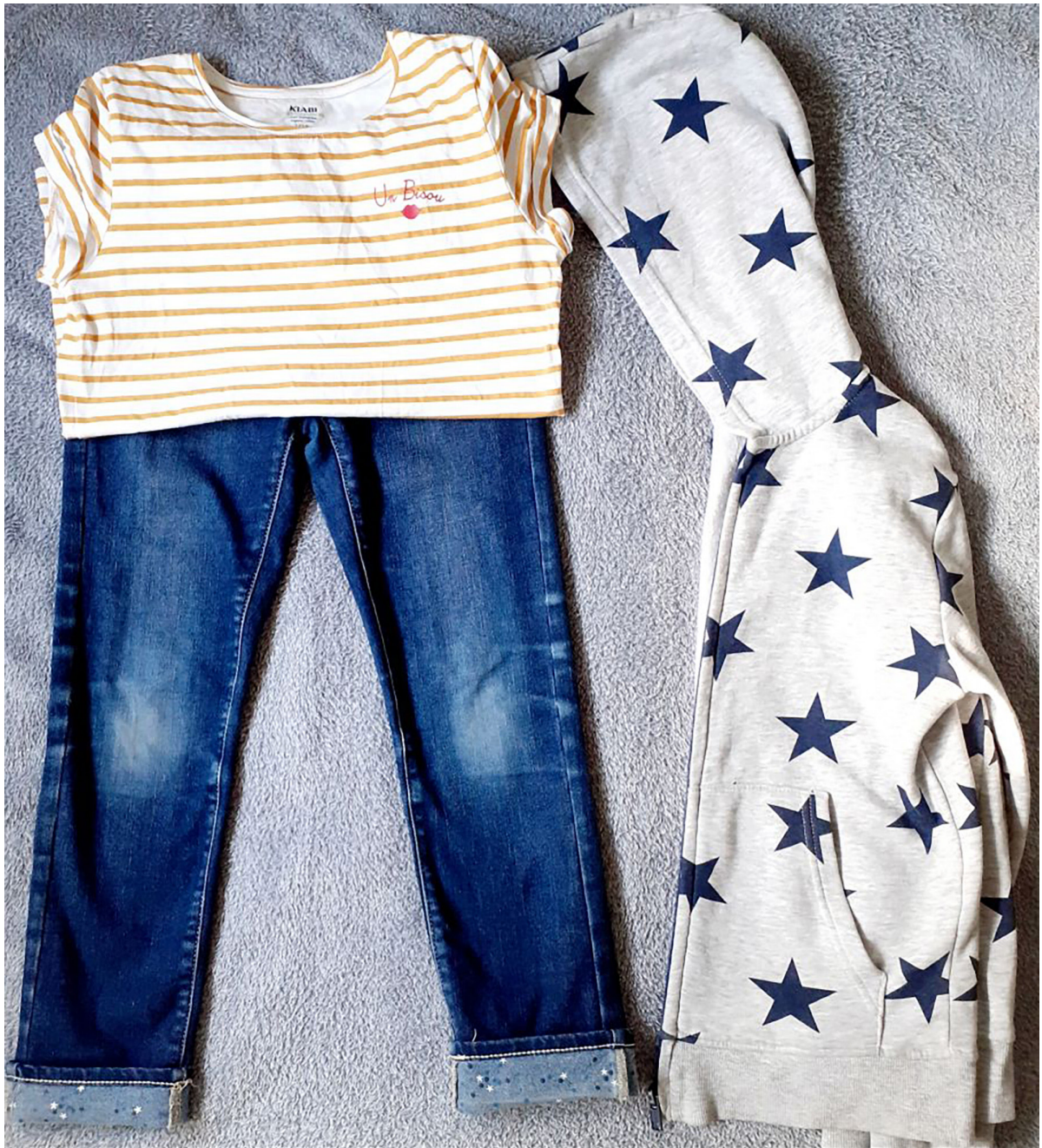
Fig. 11 My preferred home-schooling outfit, from a 12 year old girl, France.