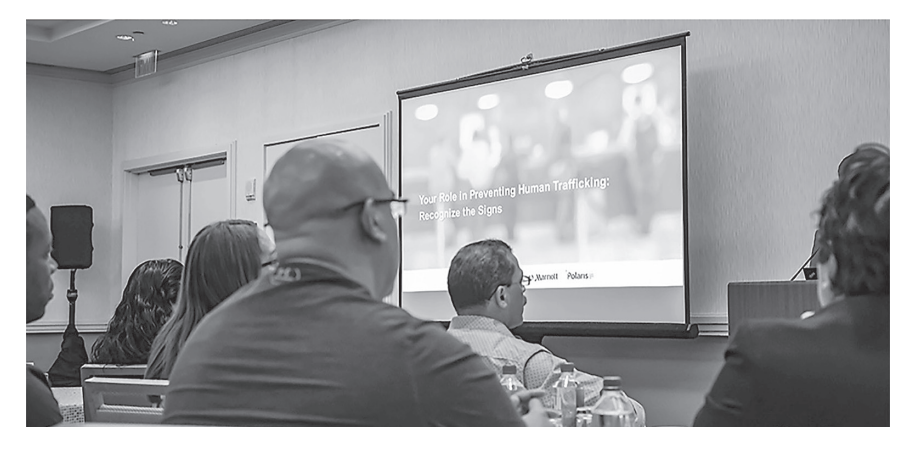
(Sheraton Times Square hotel workers learn signs of human trafficking as part of Marriott International's mandatory awareness training. Marriott 2020 )

Such indicators of human trafficking have been criticized for how they "see" human trafficking based on proxy indicators of poverty, migration, and sex work (Shih 2016).