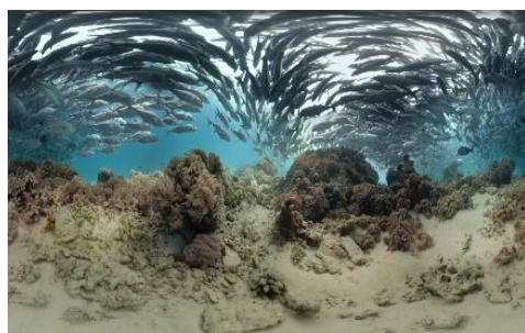
Figure 1. Example stills from each of the 30-second 360° video clips.

The 360° video was played on ZTE Axon 7 smartphone, placed inside a Google Daydream™ VR headset to allow fully panoramic viewing. The smartphone screen had a resolution of 1440 × 2560 pixels (Quad High Definition (QHD)). The smartphone was linked through a wireless connection to a Vodafone N8 Smart Tab 4G tablet using the Showtime VR app, from which the researcher could control the 360° video remotely. This allowed for a more seamless transmission, in which the researcher and carer (where present) could follow the 360° video content on the tablet screen in ‘real time’, enabling a shared experience. The Daydream headset (Figure 2) was fitted with wipe-clean face cushions which were cleaned with alcohol wipes between individual sessions, and laundered between café visits.