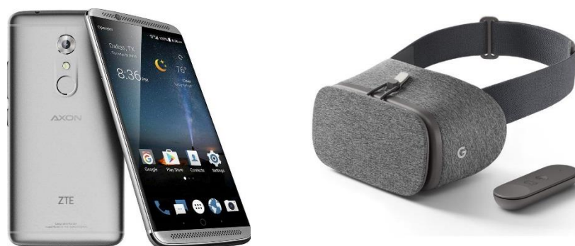
Figure 2. Daydream Headset and ZTE AXON 7 Smartphone.

The 360° video was played on ZTE Axon 7 smartphone, placed inside a Google Daydream™ VR headset to allow fully panoramic viewing. The smartphone screen had a resolution of 1440 × 2560 pixels (Quad High Definition (QHD)). The smartphone was linked through a wireless connection to a Vodafone N8 Smart Tab 4G tablet using the Showtime VR app, from which the researcher could control the 360° video remotely. This allowed for a more seamless transmission, in which the researcher and carer (where present) could follow the 360° video content on the tablet screen in ‘real time’, enabling a shared experience. The Daydream headset (Figure 2) was fitted with wipe-clean face cushions which were cleaned with alcohol wipes between individual sessions, and laundered between café visits.