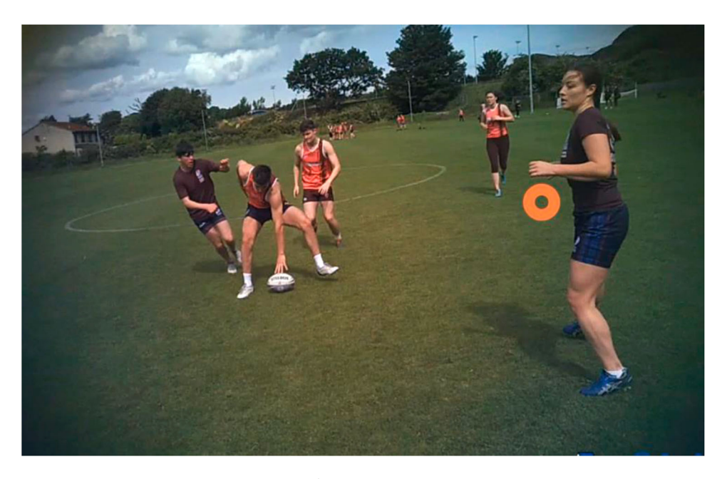
Figure 1. First-person video display with visual fixation indicated by the circle.

making process? Which are disrupting the decision-making process?