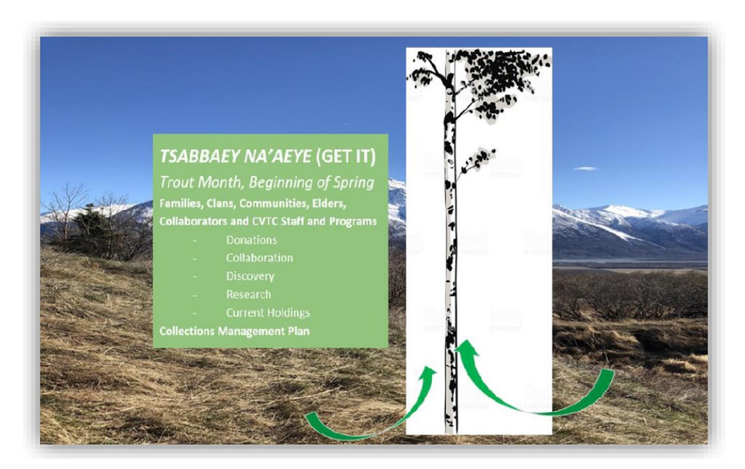
Figure 2. CVTC's DSL first stage, Tsabbaey Na'aeye, created by Selena Ortega-Chiolero and Angela Wade.

involves families, clans, communities, Elders, collaborators, and CVTC staff working together to gather collections and materials to share. Staff rely on the collections management plan for guidance in this stage. The next step is Łuk'ae Na'aaye ("salmon month" or "summer") which is the trunk of the tree with steps for access control, description, verification, and integrity, followed by Hwitsiic Na'aaye ("autumn") which signifies the start of branches extending out or developing roles and preservation infrastructure. The final step is Dencii Na'aaye ("fourth month of snow" or "winter"), when the leaves fall to represent sharing Ahtna culture in multiple ways and collaborating with partners.<sup>22</sup> All the steps outlined here each carry much more detail, including relational considerations and practical steps. Ortega-Chiolero and Wade's unique, community-centered lifecycle demonstrates the opportunities and strong vision found with a local approach based in cultural values and land-based knowledge.