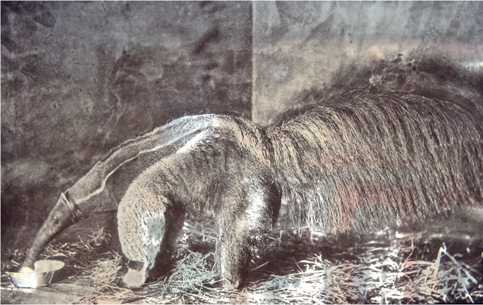
Figure 4: Anteater, London Zoo, Magic Lantern Slide, ca. 1900.

and chopped meat. 51 Though by no means natural, this diet sustained the anteater for several months and would become standard fare for zoo anteaters for the next century (Figure 4); in 1871, the first tamandua at London Zoo subsisted on “milk, in which sweet biscuits ha[d] been pulped down, and a portion of meat minced in a sausage-machine.” 52 The zoo was therefore a place where keepers experimented with nutrition and tried to find ways to approximate the natural diets of their inmates—a process that was largely accomplished through trial and error in the 19th century, but that would become a distinct area of research in the late 20th, when zoo-bred anteaters began to be fed on a blend of “ground up cat and primate kibble.” 53 Also significant in the case of the anteater—and again common practice today—is the importance of knowledge transmission between zoological institutions about the best practice in animal care, achieved indirectly in this case via the English translation of Azara's text. 54