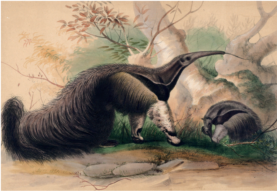
Figure 5: “The Great Anteater” (1853), by Joseph Wolf. From “Original Water-Colour Drawings by Joseph Wolf,” Vol. 4, Plate 67 (82), Zoological Society of London.

two characteristic postures: one walking majestically on its knuckles, its long tongue protruding from its mouth; the other curled up into a ball, one foreleg cupping its snout and its bushy tail cloaking its body (Figure 5). Following the anteater's death, its body was subjected to a more intensive internal examination at the hands of the famous comparative anatomist Richard Owen, who dissected the edentate shortly after its demise and measured, weighed, and sketched the animal's organs. Owen recorded that the anteater, a “full-grown female,” “weighed 62 lbs,” that its “vulva and vent opened by a common cloacal aperture,” and that “the intestinal canal is supported by one broad fold of peritoneum, as in reptiles.” He devoted particular attention to the anteater's mouth and digestive system, inspecting the “adhesive saliva with which the long, slender and moveable tongue is bedewed,” describing the muscles within the beast's jaw, and speculating that “termites may be crushed by the action or pressure of the tongue against the callous ridges [in the mouth] which seem to occupy the place of teeth.” 56 These more detailed observations, of course, could only be carried out post-mortem, underlining the secondary role of the zoo as a source of freshly dead specimens for dissection and a place for studying animal pathology. 57