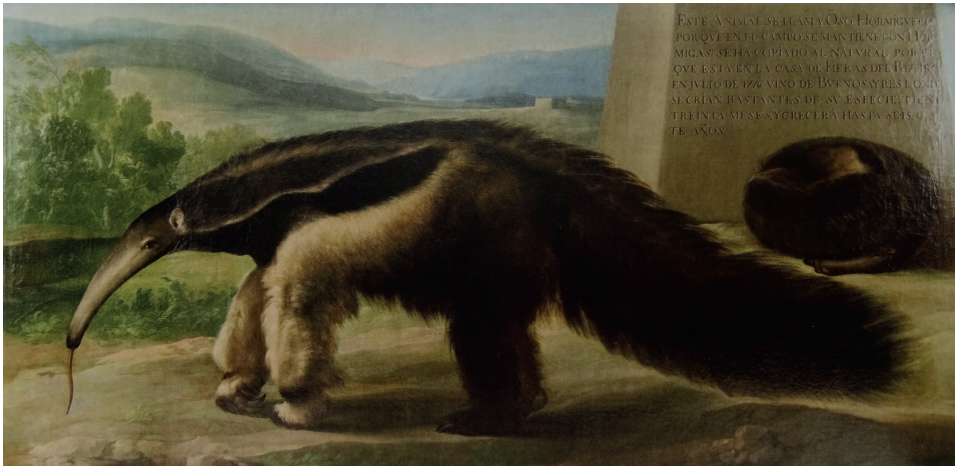
Figure 1: “Oso hormiguero” (1776), by Studio of Rafael Mengs, Museo Nacional de Ciencias Naturales.

smaller anteater appears curled into a ball on the right-hand side of the painting, its long snout buried beneath its shaggy tail. According to an inscription above the latter animal, the portrait was “taken from life in the Casa de Fieras in 1776” when the anteater was 30 months old and still not fully grown. We do not know which of Meng’s apprentices sketched the edentate, though recent research suggests it may have been a young Francisco de Goya. 23