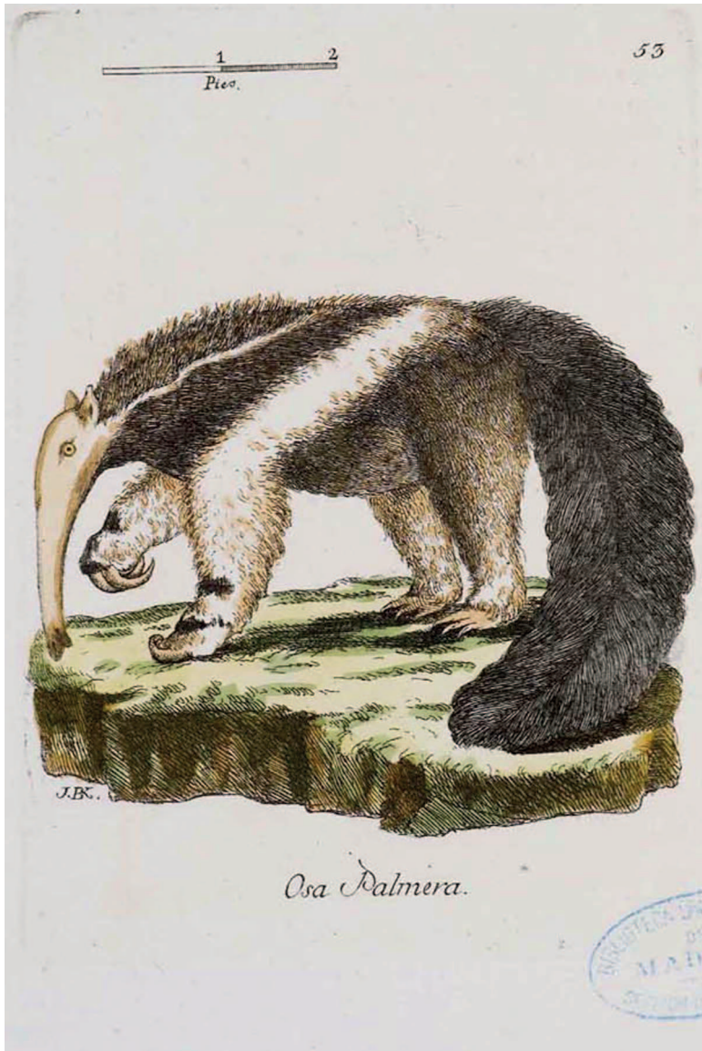
Figure 2: “Oso Palmera.” From Colección de Láminas que Representan los Animales y Monstruos del Real Gabinete de Historia Natural (Vol. 2, Plate 53), by J. B. Bru, 1786, Madrid, Spain: Andrés de Sotos.

The anteater thus arrived in Spain at a moment when its species was under close academic scrutiny and became the focus of both critics and champions of American fauna.