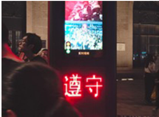
FIGURE 1 A real-time image captured by AI chip-embedded surveillance cameras.

vehicles automatically identified the appropriate bins and processed them accordingly. The waste was then transported to temporary transfer stations by driverless vehicles, and robots then sorted out recycled or hazardous items before sending them to different end points for processing. The experiment, jointly enabled by national and city government and AI companies, explored a possible trajectory for an AI-enabled operating waste system. This produced an experimental mode of automated waste management used driverless vehicles, image recognition cameras and robotics to autonomously monitor, collect, transport, recycle, dispose of waste without – apparently – the intervention of humans. However, this pilot system needs to be viewed as part of a much wider experimental landscape of technical and social measures designed to promote waste sorting (see Li and Wang, 2021 ). Yet the urban AI can also be used to control humans (see Figure 1 ). Shanghai uses AI to autonomously identify lawbreakers, jaywalkers, and other criminal suspects. This is reflected in trial installments of facial recognition cameras in the Shanghai Bund and some of the city's metro stations for the aim of ensuring urban security.