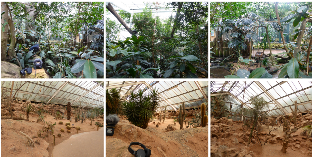
Fig. 1. Top photos show the furnishing and layout of the FOB at BZ. Top left: location of tripod and observer in front of the rock the sound recorder is placed on. Top middle: taller trees and higher perching. Top right: lower planting an internal aviary. Bottom photos show the furnishing and layout of the DH at PZ. Bottom left: path through exhibit. Bottom middle: location of tripod and observer in front of the rock the headphones are placed on. Bottom right: planting and substrates provided in the enclosure with off-show areas at the far back of the picture.

The ethogram of state (long duration) behaviours (Bateson and Martin, 2021) included preening (cleaning of feathers with bill); bathing (washing of feathers with water); foraging and feeding (searching for and ingestion of food); alert (prolonged vigilance in an aroused posture); locomotion (walking, running, climbing, swimming); flying; courtship (reproductive display specific for that species) and nesting (building of a nest and incubation of eggs/chicks); social (interaction lasting for the minute sample period, both between and within species including aggression); vocalisation (long-duration calling that occurred for the minute sample interval); perching (on feature around the enclosure in a relaxed state); perching high (at the top of trees or infrastructure of the aviary well above head height of visitors, again in a relaxed state); sitting or loafing (resting on a perch or the ground, or standing without movement in a relaxed manner); perching in cover (the bird was not