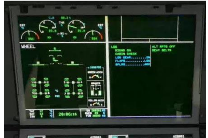
Figure 2: Modern engine indications. The presentation has changed from Figure 1 but in essence, the parameters shown have their roots in the flight engineer panel.