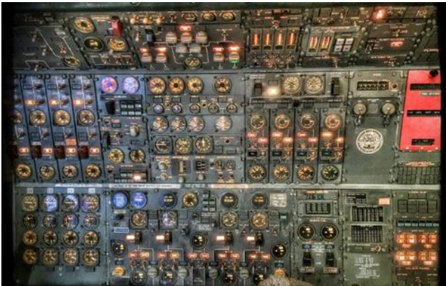
Figure 1: Part of the flight engineer control panel. Many of these systems have been now automated leading to the removal of this role in all modern civil aircraft.

Present engine indications show visible lineage to past ways of operating. With the introduction of Full Authority Digital Engine Control (FADEC) † in the 1960s, engines have tended to look after themselves. Thrust is demanded by the aircrew or, by the aircraft itself using the autothrust/ autothrottle system. Flight crew monitor engine health and performance during the flight. The removal of the independent flight engineer role and the associated panel (Figure 1) have meant that automated systems such as FADEC look after most aspects of the engine and related systems during flight. Today the flight deck have access to a set of indicators that reflect the engine's status in response to thrust demands from either the autopilot or the manually from the flight deck (Figure 2). The presentation style of the information has evolved with the introduction of the glass cockpit, but in essence the parameters shown: temperature, percentage RPM, fluid status (etc.) remain the same to this day.