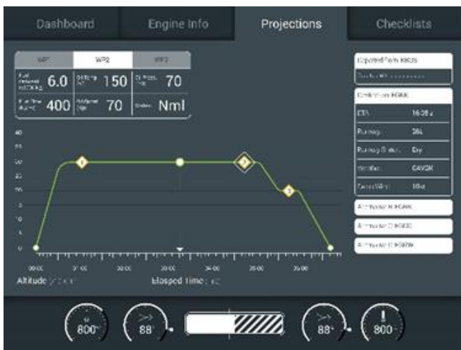
Figure 4: Prototype interface that captures level 3 of the SAT model.