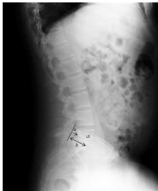
Fig. 1 Lateral radiograph of the spine of patient 11 of group I. Male, 29 years, type IV O.I., I grade listhesis, moderate biconcave fracture. The segment a indicates the amount of anterior translation of L5, compared to the anterior-posterior width of the sacral endplate (segment b )

Genant's semiquantitative grade classification method was applied on lateral view to evaluate the L5 fractures; it classifies them as mild (20–25 %), moderate (26–40 %) or severe grade (>40 %) according to the severity of the fractures, and as wedge, crush or biconcave deformity in relationship with the involvement of the anterior, posterior or both vertebral walls [13].