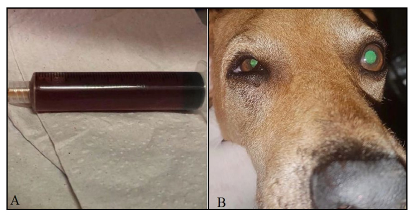
Figure 1. A- Dark coloured urine ("coke like"). B- Honer's syndrome at the right side.

During physical examination, the dog presented dehydration of 6% and rectal temperature 36.8°C, but other parameters were within the normal range. Upon neurological examination, ventromedial strabismus was observed on the right side, vertical nystagmus, flaccid tetraparesis and absence of proprioception in the 4 limbs. Blood count and biochemical analyses (albumin, alanine aminotransferase (ALT), alkaline phosphatase (FA), glucose) were performed, and hypoalbuminemia (2.7 ref.: 2.6 to 3.3 g/dL) and creatinine and CK increase were verified (Table 1). Urinalysis was also performed (collection by urethral catheter), and a dark color was verified, with the presence of occult blood without, however, erythrocyturia (Figure 1A).