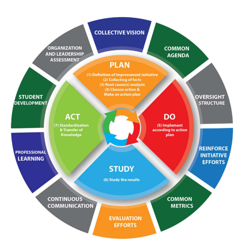
Figure 2. Plan-do-study-act (PDSA): Seven steps of continuous improvement (Lodgaard et al., 2012), & the ARCHES ten essential drivers (n.d.).

The intersectionality between the PDSA, improvement science, and continuous improvement method can offer districts a prescriptive roadmap to improvement that permeates the system and is sustainable. Figure 2 is an adapted interpretation of the CIF informed by participants' understanding of improvement methods and the guiding artifacts impacting the internal shifts in practices, policies, strategies, or, as one principal described, the "day to day" tasks that do not always transcend to transformative practices.