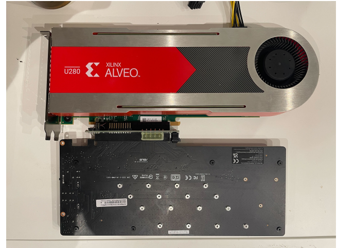
Figure 2: Hyperion: U280 FPGA-side up.

Hyperion is prototyped with a Xilinx U280 FPGA and NVMe device as shown in Figure 2 and Figure 3 .