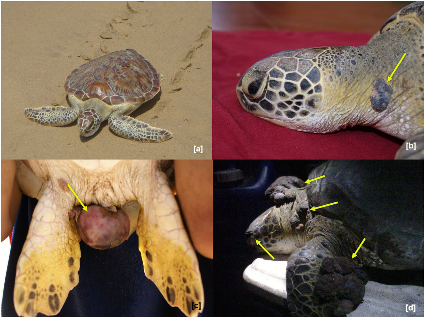
FIGURE 2. Green Sea Turtles captured in the Gulf of Venezuela with Fibropapillomatosis (arrows indicate skin tumors), its body location and categories of tumor severity (0 = non-diseased [a], 1 = mildly afflicted [b], 2 = moderately afflicted [c] and 3 = severely afflicted [d])

FP is considered a threat to GT populations worldwide, mainly due to its prevalence and severity [11, 22]. Overall, most MT with FP evaluated were immature (85.7 %), with CCL larger than 35 centimeters (cm), which correspond to findings in Florida, Hawaii, Brazil and Australia [2, 11, 14]. Previous research has proposed two potential explanations for the presence of FP in smaller (i.e. younger) turtles, as these individuals are exposed to the virus and several stressors associated with migration upon recruitment to neritic zones, which indicates a horizontal transmission. These stressors also might enhance the emergence of tumors and FP lesions in latently infected turtles [22]. Direct transmission may also be occurring between co-habiting turtles via interactions such as mating and aggression [20, 22]. The GV is known to be a recruiting and development area for MT, specifically, the GT population in the GV includes individuals from many rookeries throughout the Caribbean (such as Florida, México, Colombia, Costa Rica, Nicaragua, Isla de Aves [Venezuela],