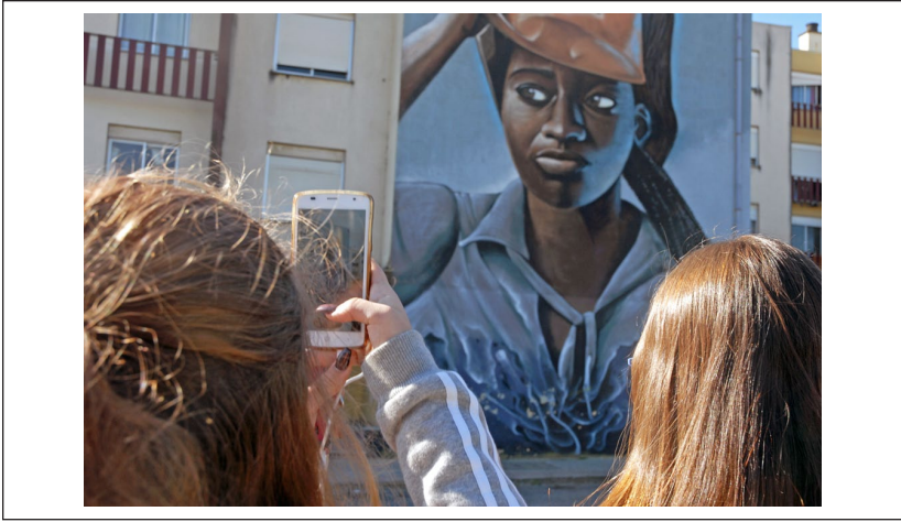
Figure 3. The whyte mask.