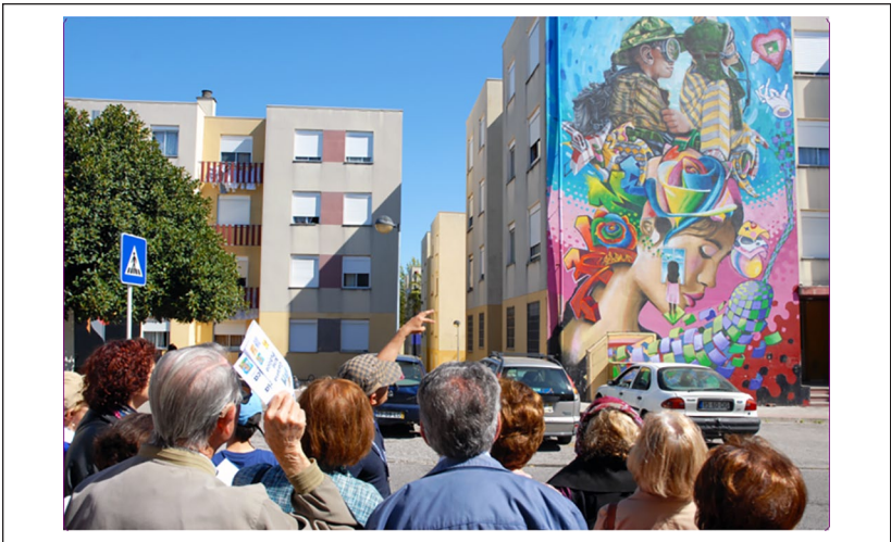
Figure 1. Street at tourism in Quinta do Mocho.

The visibility of this street art project is largely due to the local guides, responsible for the enchanting tour dynamics that have attracted a growing number of tourists to Quinta do Mocho (Figure 1).