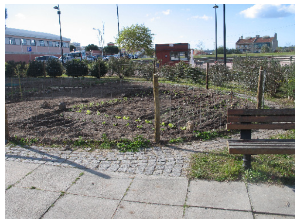
Image 3, 4: “Formal” Urban Farms, Campolide - Lisbon