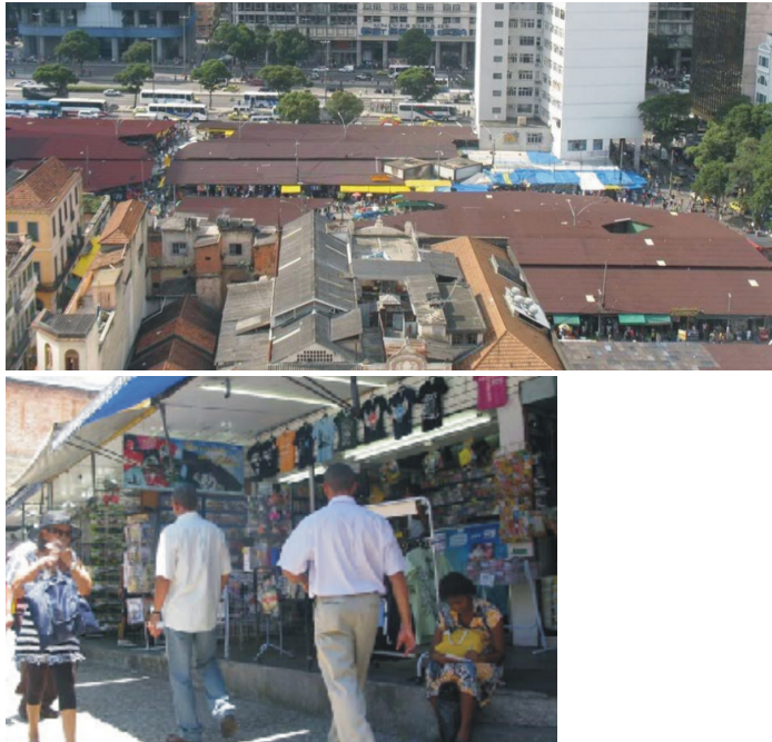
Images 8,9: Camelódromo da Uruguaiana

any assistance or infrastructure. Initially sales decreased, because the Camelódromo was not in the main route of people flow, which made them lose lots of customers. However the low prices eventually brought the customers back over the time, making the Camelódromo da Uruguaiana a famous place. The whole infrastructure constructed in the Camelódromo was done by the vendors association and each camelô remained however responsible for his own stand. 1