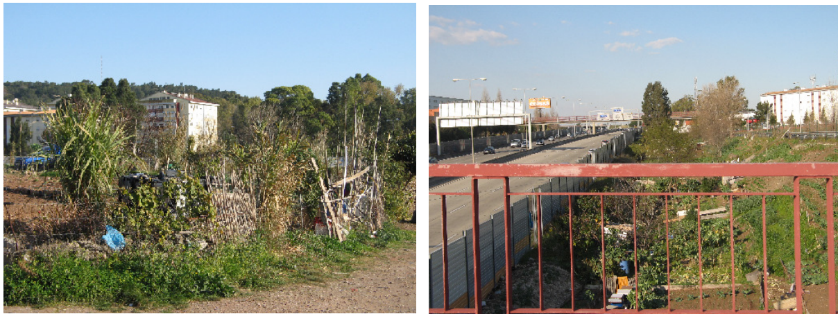
Image 1, 2: “Informal” Urban Farms, IC17, CRIL – Lisbon

conditions (especially along the highways and traffic axes, and land with steep slopes and poor condition of urbanization) still exists.