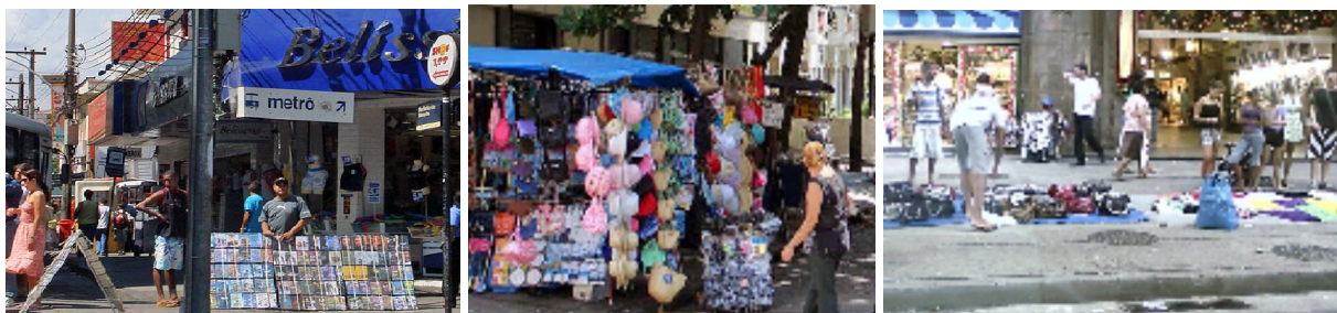
Images 5,6,7: "Informal" Street Vendors – Rio de Janeiro

The informal street vending phenomenon in Rio is characterized by its diversity. This can be observed in the variety of vending places, in all neighborhoods of Rio from streets to public transportation, in the many ways that the sales are done, using different equipments to expose and carry their products, in the wide range of working times, they can be found 24 hours a day during the whole year, and in the heterogeneity of the vendors. Many people unable to find a formal job become informal street vendors and remained in the informality either due the continuous lack of formal opportunities or their better adaptation to being self employed informal street vendors (Monte, 2010).