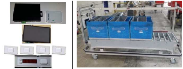
Fig. 2. TCP/IP Controller, Router, Battery, an AT705(L) and 4 AT70N; Trolley.

Following our approach, a first IoT was installed and it contained a module available for sale by ATOP Technologies. This module consists of a large light button, a 7-segment display and two small buttons on the left of the screen (Fig. 2). This module is connected to a TCP/IP controller (black box on top of Fig. 2). The controller is connected to a router (white box) and enables Wifi-RS232 or Ethernet-RS232 network. This IoT module is installed on the Kanban furniture (were the factory products are placed) and on the trolley (Fig. 2 right side) which is powered by a battery of the order of 50000 mAh.