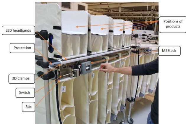
Fig. 4. The final installed IoT device (IsiBox) on a trolley.

In addition, parts were manufactured, using a 3D printer, in order to protect the edges of the metal sheet and to facilitate their set up on the trolley by means of clamps. This new connected object, called IsiBox, is installed on 24 trolleys (Fig. 4).