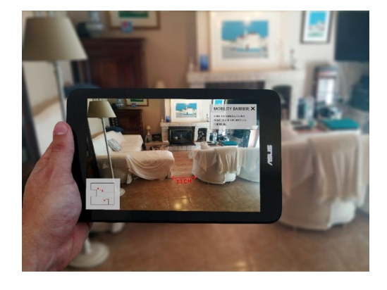
Figure 4 Mock-up of the OLA EA-SA module showing user selecting the hazard and a recommended action for the short distance hazard.