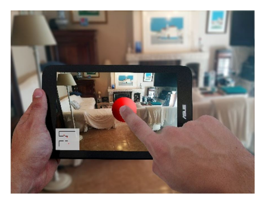
Figure 1 Mock-up of the OLA EA-SA module showing an alert sign near two pieces of furniture after detecting a hazard.

As Teresa tapped the red dot, the space between the sofa and the armchair was highlighted with a mark showing the width of the space between the two elements. Simultaneously a popup appeared on the screen with the message "Mobility Barrier: There isn't enough space between the two pieces of furniture" which was also read out loud by the OLA app (Fig. 2). As she tapped the mark on the screen, a new popup appeared on the screen with the message "Recommendation 1: Move the Armchair away from the Sofa; Recommendation 2: Remove one of the elements" which was also read out loud by OLA (Fig. 3 and Fig. 4). Teresa and her son then closed all the popups and continued to examine the remaining environmental barriers that were identified in her house. By providing an overview of the environmental barriers existing in her home, OLA helped Teresa and her son to correct them and avoid potential hazards.