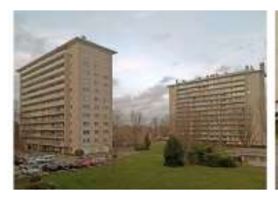
Figure 1. The three case studies in Ganshoren, Auderghem, and Woluwé-Saint-Lambert