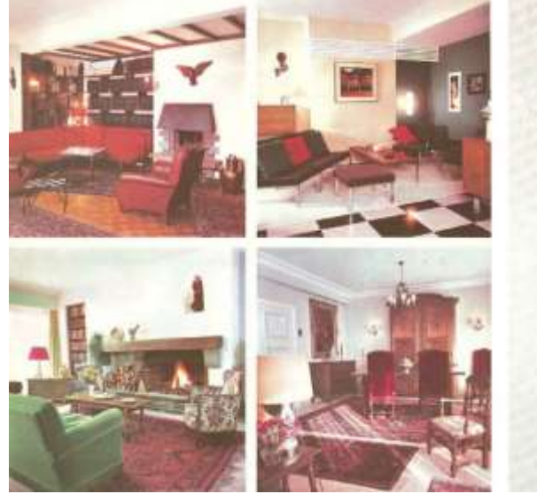
Figure 4. Collin appealed to the housewife's creative instinct by making the apartments adjustable