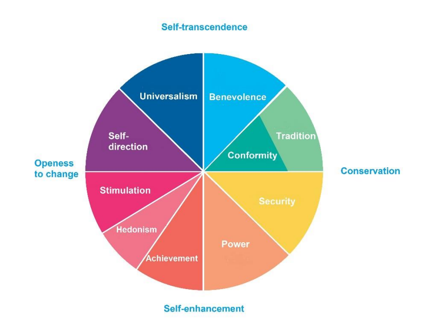
Figure 1. Circumplex model of the Theory of Basic Human Values