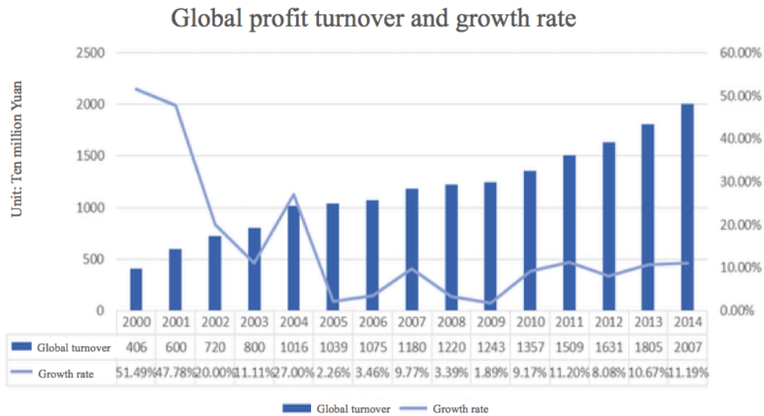
Figure1 -- Global profit turnover and growth rate (2000-2014)

Figure 1 summarizes the global profit turnover and growth rate of Haier Group during the period from 2000 to 2014. It can be seen that before 2005, Haier's growth rates were higher than those of the following years, in which a rapid decline in growth rates occurred resulting to only single-digit. From 2004 to 2009, for example, global profit turnover increased from 101.6 billion RMB to 124.3 billion RMB, but the average annual growth rate only was 4.15%, the growth bottleneck was very obvious. Even after 2009, the growth rate is far less than Midea and Gree (Two popular household brands in China).