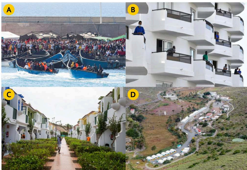
Figure 4. Places for immigrants' accommodations.

A. Puerto de Arguineguín, Mogán, Gran Canaria