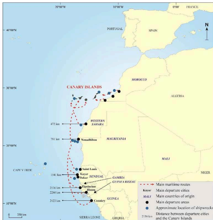
Figure 2. Places of origin of recent irregular immigration to the Canary Islands.