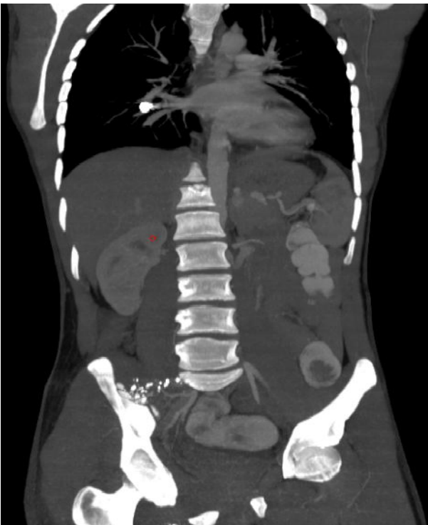
Figure 2. Metallic density image in pulmonary artery in thorax CT horizontal section.

pneumothorax was detected. The patient was monitored and taken under observation. Since he was asymptomatic during the observation period, no surgical intervention was considered. Patient discharged after three days of observation. A ballistic examination revealed that the injury was carried out with a low-speed, small-caliber gun. On the 13 th day the patient didn't have any symptoms and on thorax CT the images of bullets in the pulmonary artery remained in the same localization. Later, the patient walked out of follow-up because he felt well and did not have