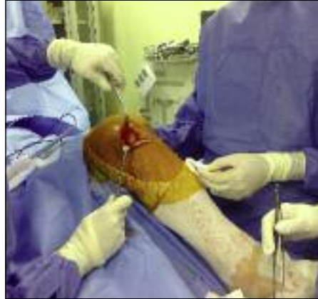
Fig. 5. The medial femoral condyle was evident through an ample breach of the extensor retinaculum, the deep fascia and the capsule.