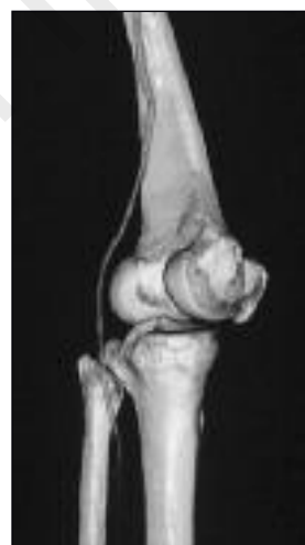
Fig. 3. The digital femoral arteriography excluded any damage of the popliteal artery.

tibia backward in internal rotation, was ineffective and thereafter it became necessary to proceed with open surgical reduction.