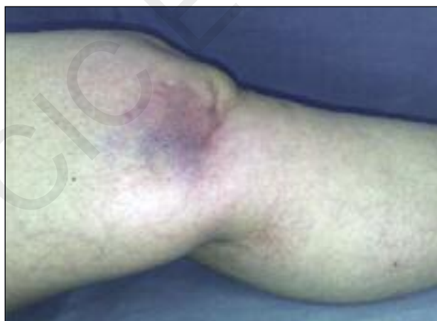
Fig. 1. Clinical appearance of the left knee in slight flexion and valgus, with invagination and severe ecchymosis of the skin and soft tissue on the medial side (“dimple sign”).

The reduction maneuver, performed by pushing the