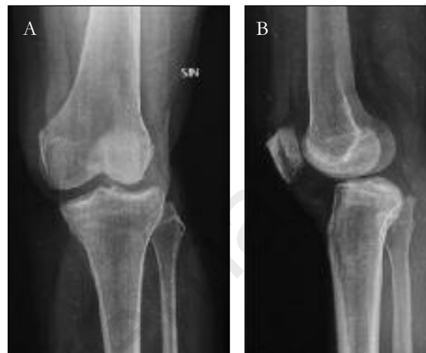
Fig. 2. Anteroposterior (A) and lateral (B) X-rays of the left knee after the trauma show a posterolateral subluxation of the tibia and enlargement of the medial joint space.