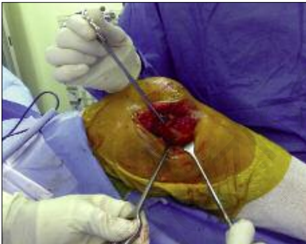
Fig. 6. Complete rupture of the MCL. The proximal end of the ligament is held by the scissors.

posterior cruciate ligament (PCL) were torn. Medial meniscus was intact.