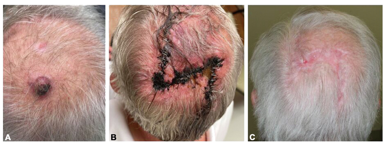
Fig 1. A, Initial presentation; pink-to-purple, ulcerated, ill-defined nodule with hemorrhagic crusting measuring approximately 2 cm on the posterior aspect of vertex of the scalp. B, One-week following wide local resection and O-Z flap repair; well-healing incision with sutures in place. C, Four-months postoperation; well-healed incision with slight atrophy.